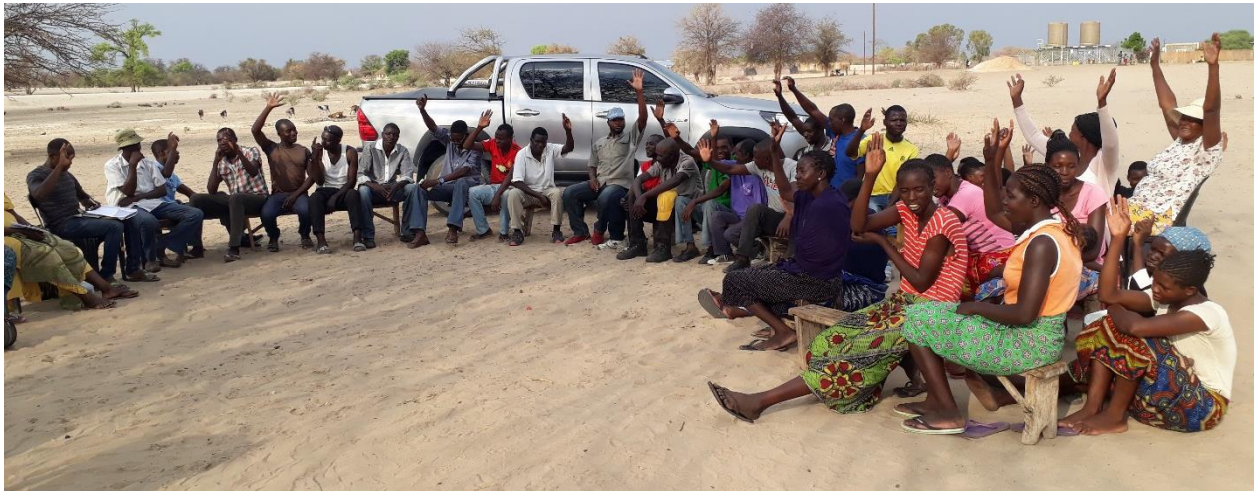
Figure 3: Show of hand by Korokoko community members as sign of accepting a project.