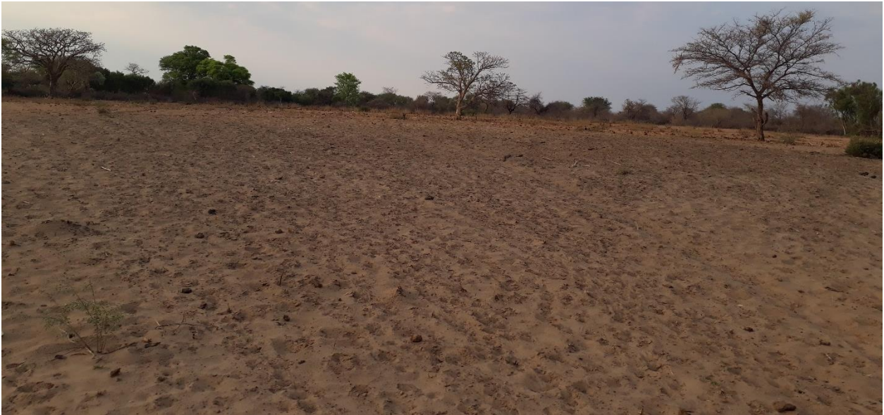
Figure 4: One of the crop field with reservation before finale agreement.