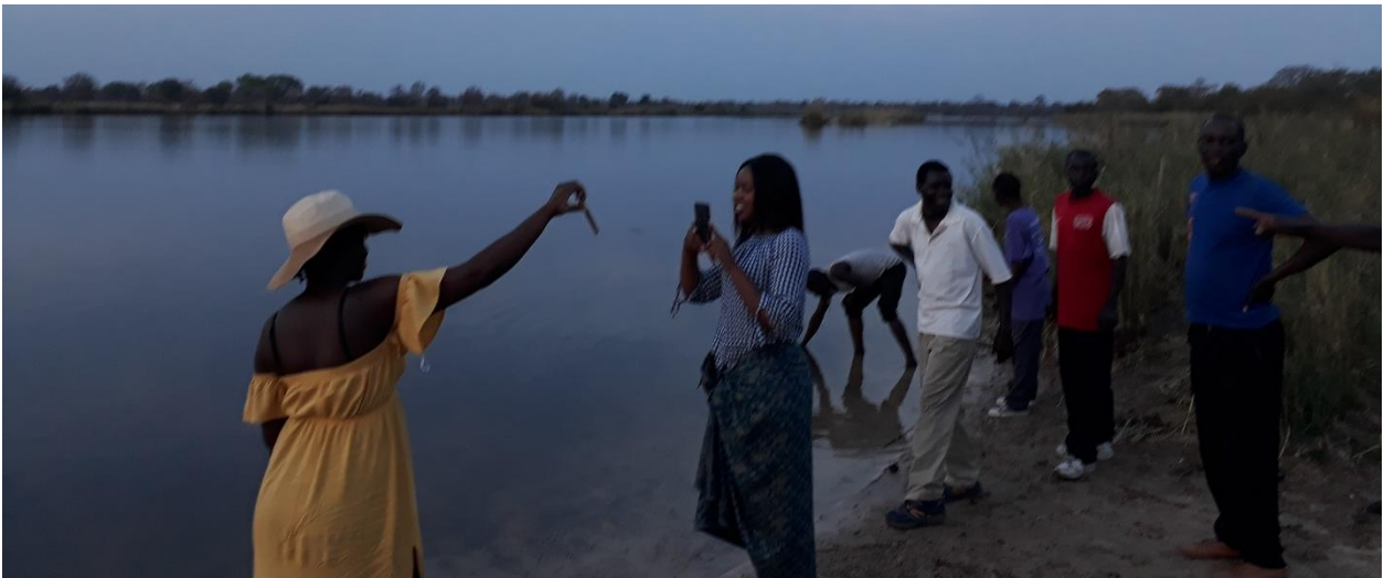
Figure 5: The riverside where water would be abstracted for irrigation.