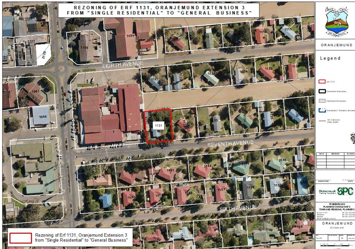
Figure 3: Areal map of Erf 1131, Oranjemund Extension 3