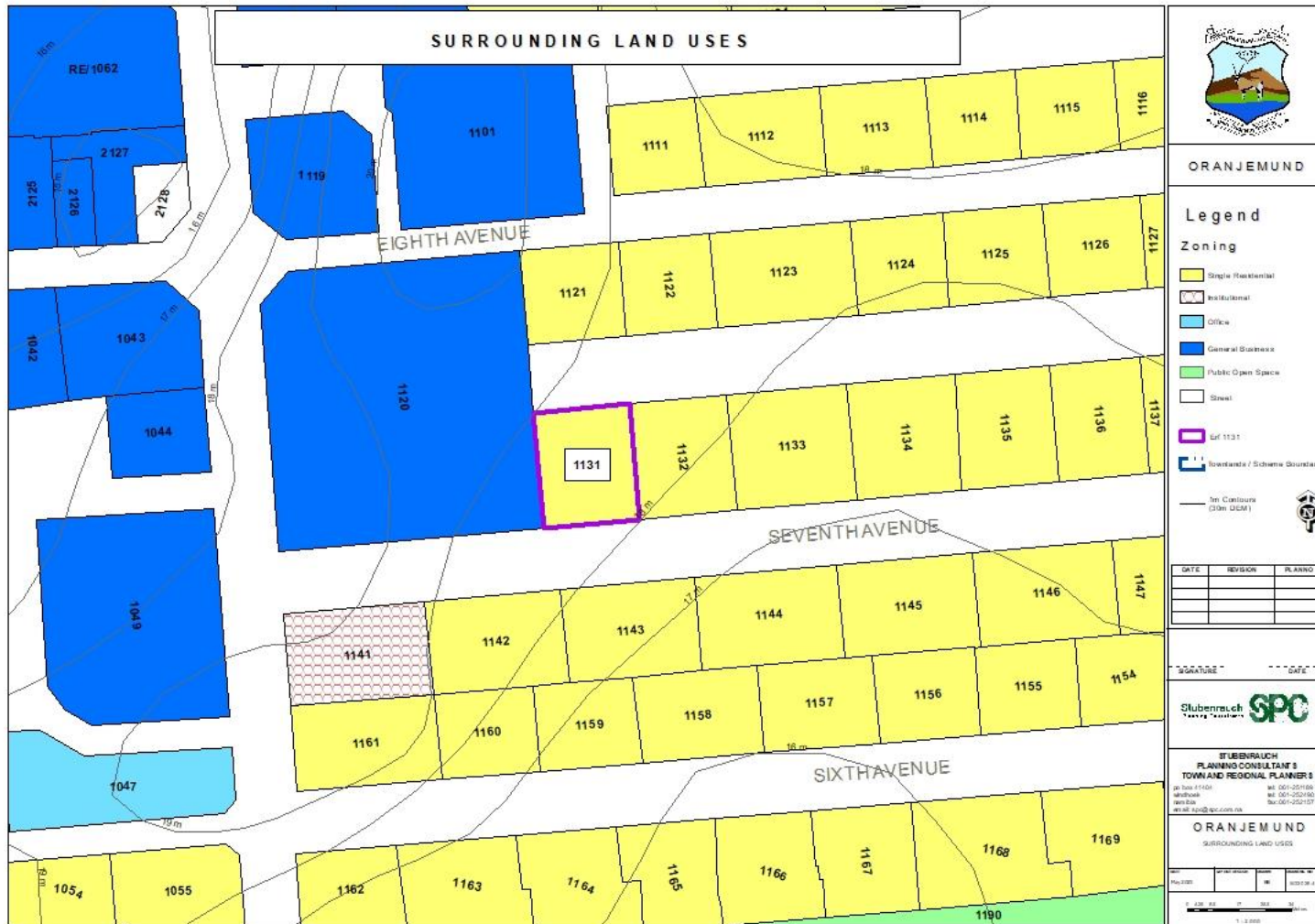
Figure 4: Erf 1131, Oranjemund Extension 3 Surrounding Land Uses