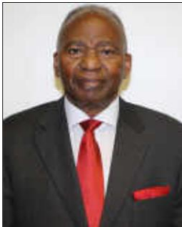
National Assembly Speaker Professor Peter Katjavivi

WINDHOEK - Speaker of the National Assembly, Peter Katjavivi, on Friday closed the National Assembly for the year in light of the National Assembly and Presidential elections slated for 27 November. Friday's session was the last parliamentary session of 2019, with the next session scheduled for 11 February 2020. Closing the session, Katjavivi bid farewell to parliamentarians, wishing them luck on the upcoming elections. "As we move from here, I wish you all well, good health and all the best in the upcoming elections