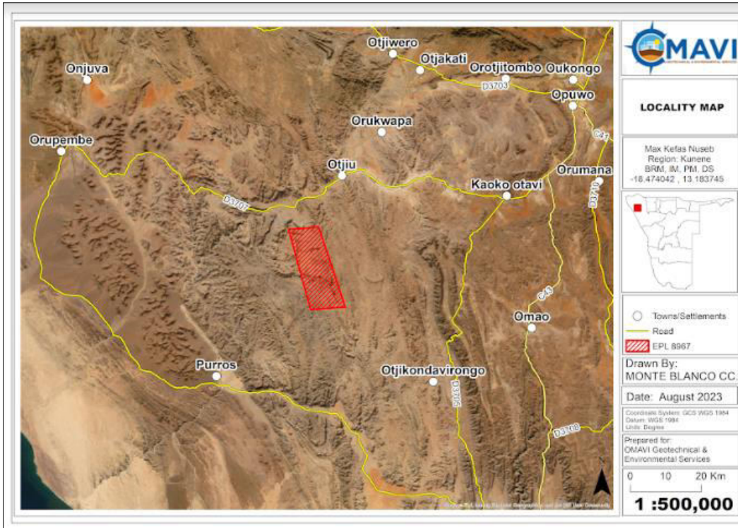
Locality and layout boundaries of EPL-8967.