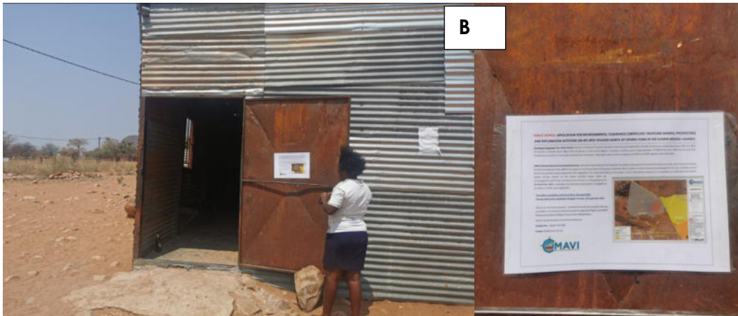
The A3 Posters pasted at the; A - Kunene Regional Council in Opuwo and B - community convenient Shop & Bar IN Ehomba