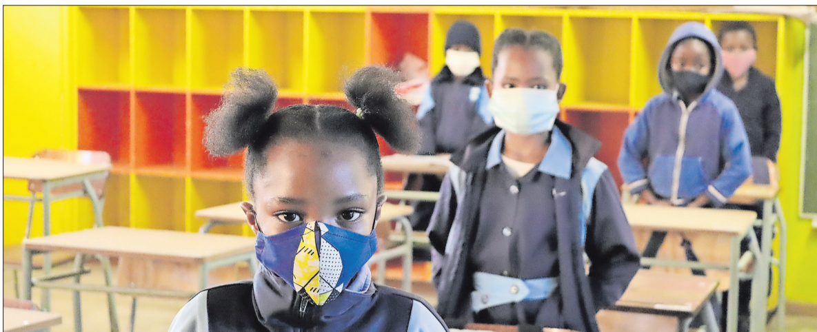
BACK TO SCHOOL: Learners at Martti Ahtisaari Primary School were geared up for their first day back at school yesterday.

"It is the right of every child to be educated and we are glad to uphold this right," he said.