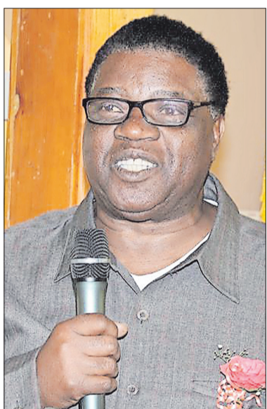
UNHAPPY: Labour minister Utoni Nujoma.

“We have to comply with the declaration, but as I am speaking today, my declaration is on Facebook dis-