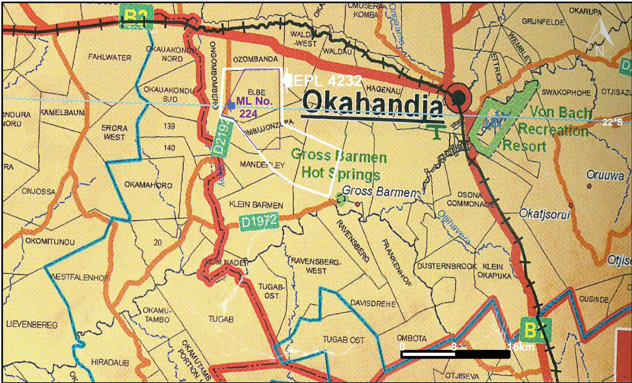
Figure 3: Commercial farmland covered by the ML No. 224 (Source: Namibia 1:1000000 Registration Divisions Extract).