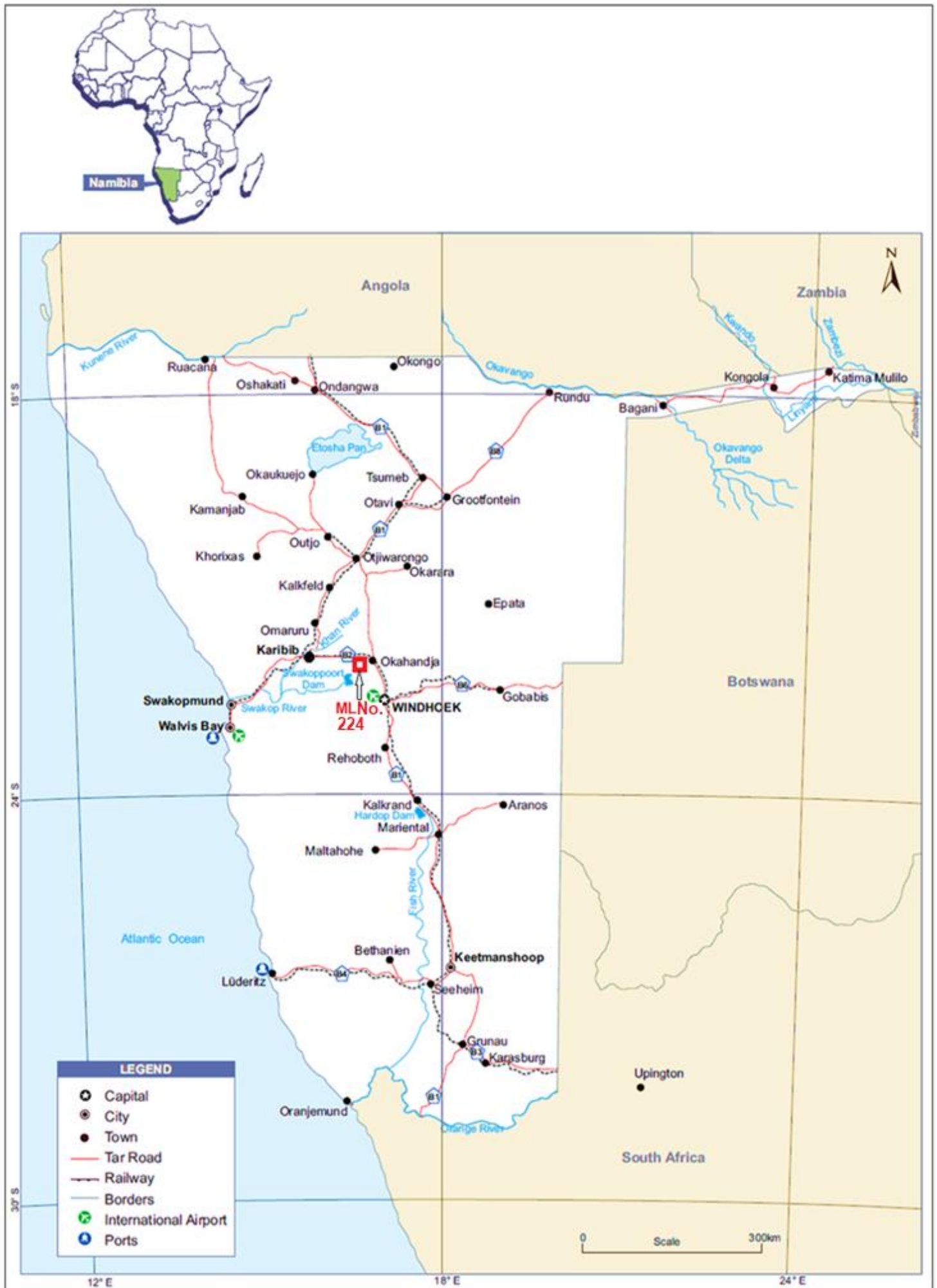
Figure 1: Regional location of the ML No. 224.