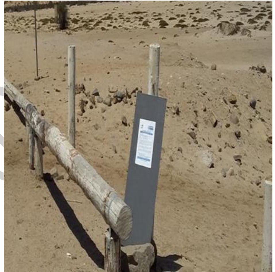
On-site Notice Board