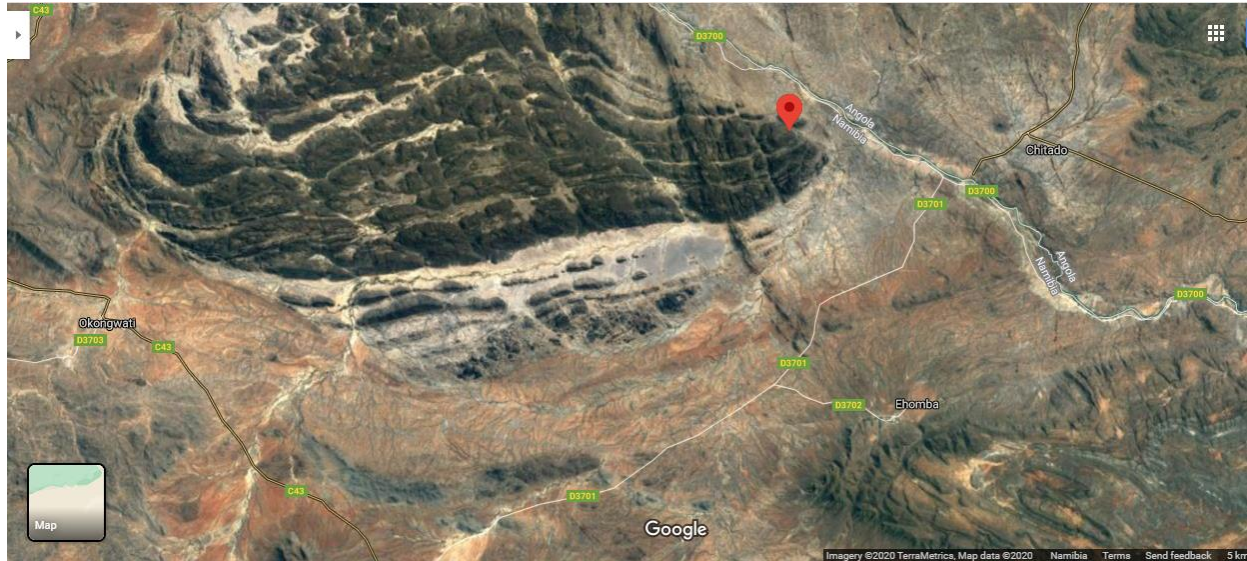
Figure 1: Locality map of the mining claims 70115 and 70116 at Otjimuhaka village, Swartbooisdrift, Kunene Region (Google 2020).

The proponent intends to undertake mining activities on mining claims 70115 & 70116 situated at Swartbooisdrift, Otjimuhaka village, 120 km northeast of Opuwo, Epupa Constituency, Kunene Region, Namibia (northwest). Refer to the locality map of Otjimuhaka village in Figure 1 and Figure 2 for the locality of the 2 mining claims 70115 & 70116 for the dimension stones (GPS: -17.31055556, 13.74333333) for the dimension stone covering a total of 304 711m 2 .