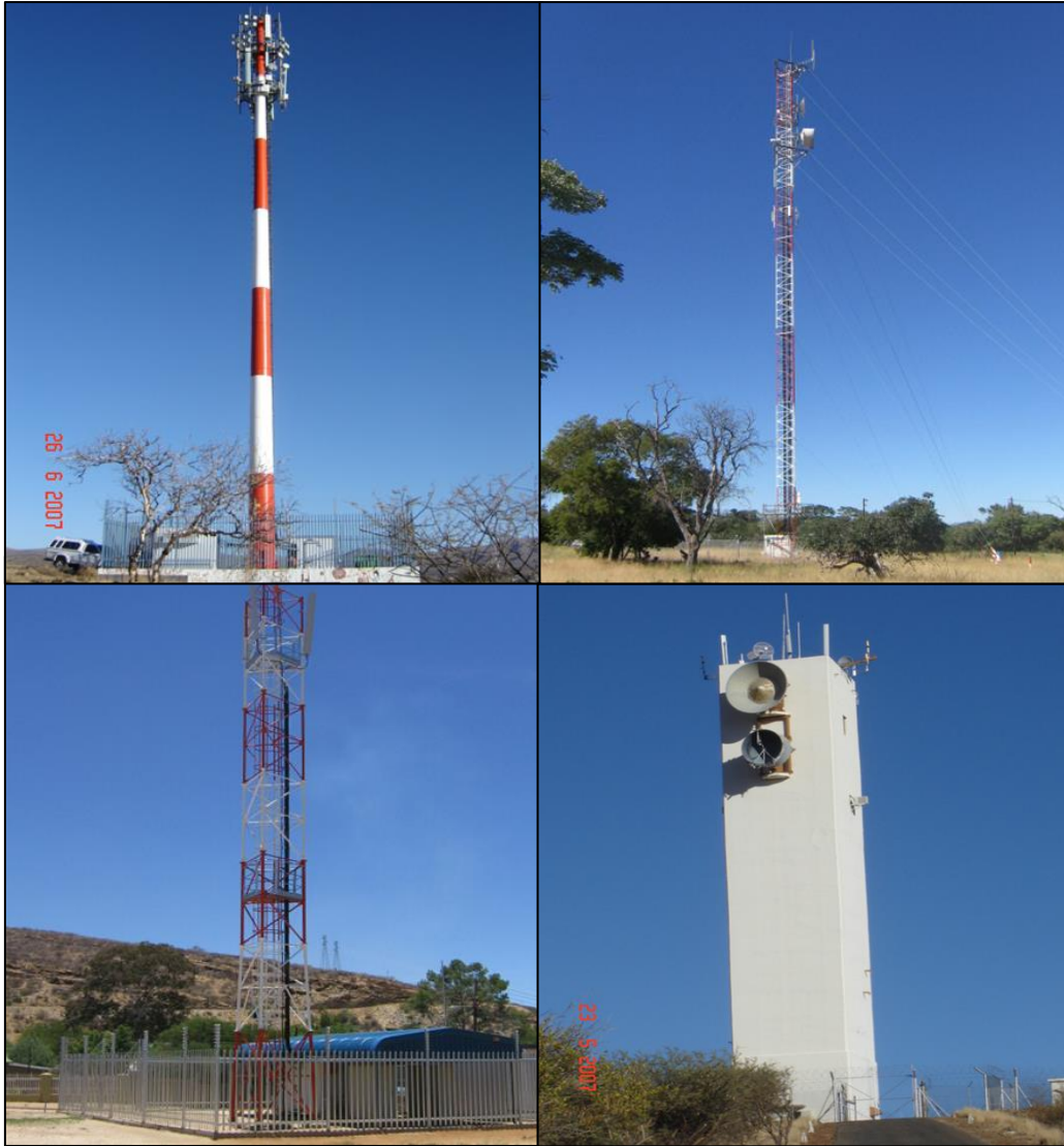
Figure 3-1: Alternative tower structures.