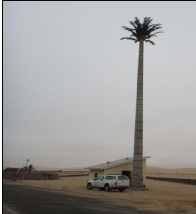
Figure 2-1: Example of proposed tower ( https://www.powercom.na/index.php/portfolio-details/item/5-palmtree )

It will additionally include the construction of an equipment room which will house the communication equipment. The site will be fenced off in order to limit public access.