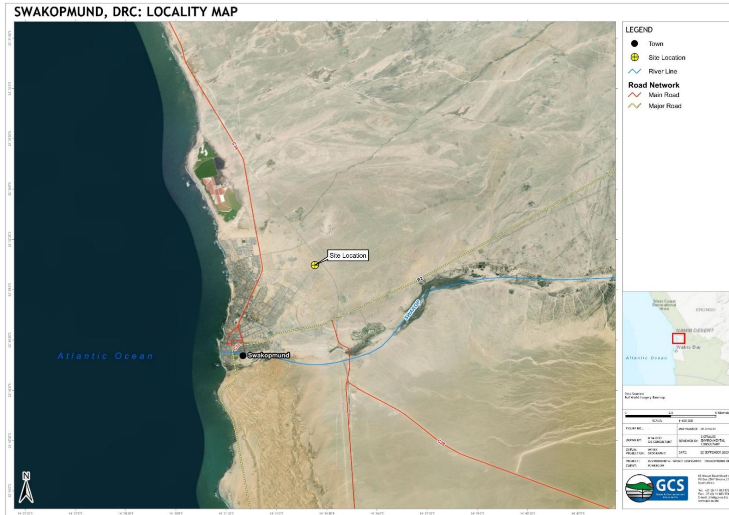
Figure 1-1: Location of proposed BTS sites in Swakopmund