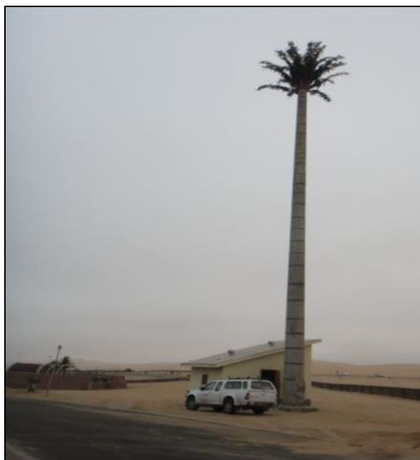
Figure 3-2: Tower proposed for the site

The design was selected as it is aesthetically more appealing and blends into the surrounding environment. It thus reduces the visual impact of having a tower within a residential area.