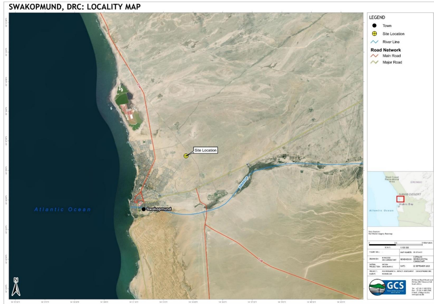
Figure 1-1: Location of proposed BTS sites in Swakopmund