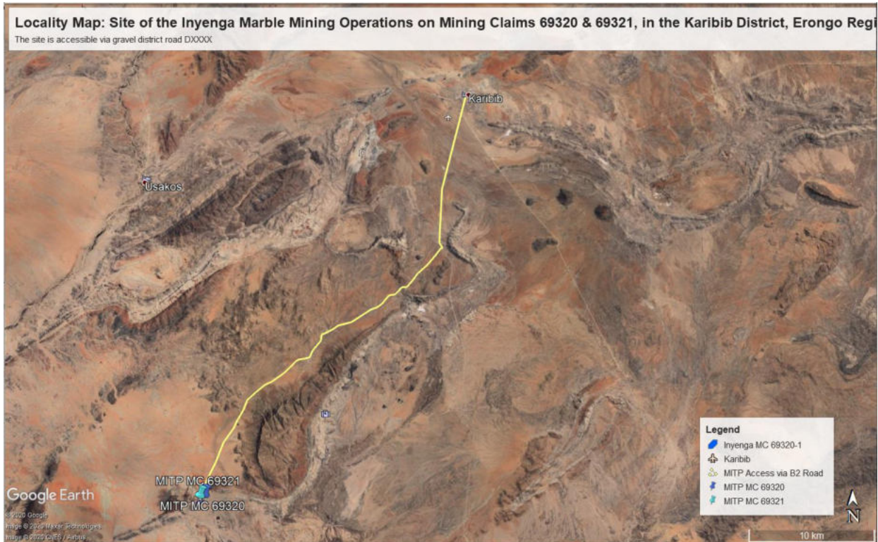
Fig. 3: Locality map of the proposed exploration activity’s site or area in the Otjozondjupa Region, Namibia.

Mr. Inyenga operates his business activities on Mining Claims No. 69320 and 69321, on a quarry situated about 45 km South-west of Karibib central on Farms Etusis No. 75 and Gamikaub West 115 respectively (see Fig. 3 – Locality Map and Table 1 – exact coordinates), in the vicinity of Karibib Town in Erongo Region.