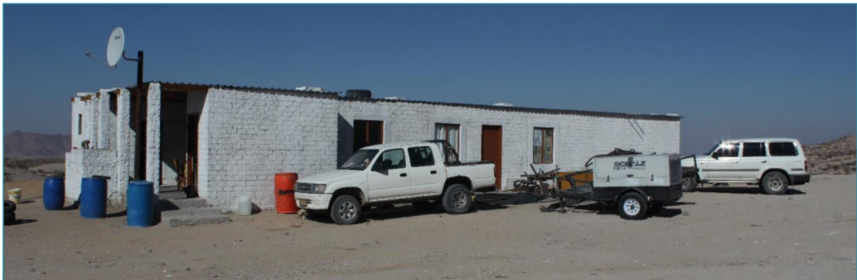
Fig 6: Shows the Staff accommodation and Current Office Facility (including ablutions), in foreground is the fleet collection (light vehicle and compressor equipment)

Water for both domestic and operational use is sourced from the main farm boreholes and supplied by truck on a weekly basis (1000 litres) and currently stored in an equivalent sized tank, however plans are to expand storage capacity to 5000 litres month supply. Energy is supplied by 5 Watt diesel powered generator, used mainly for food preservation and lighting at the lodging facility, while for cooking the energy needs are met use of gas. The diesel supply for the earthmoving equipment is stored in raised 4500 litres capacity tanks (Fig 10) and is also brought in by truck to the project site on pre-existing farm tracks.