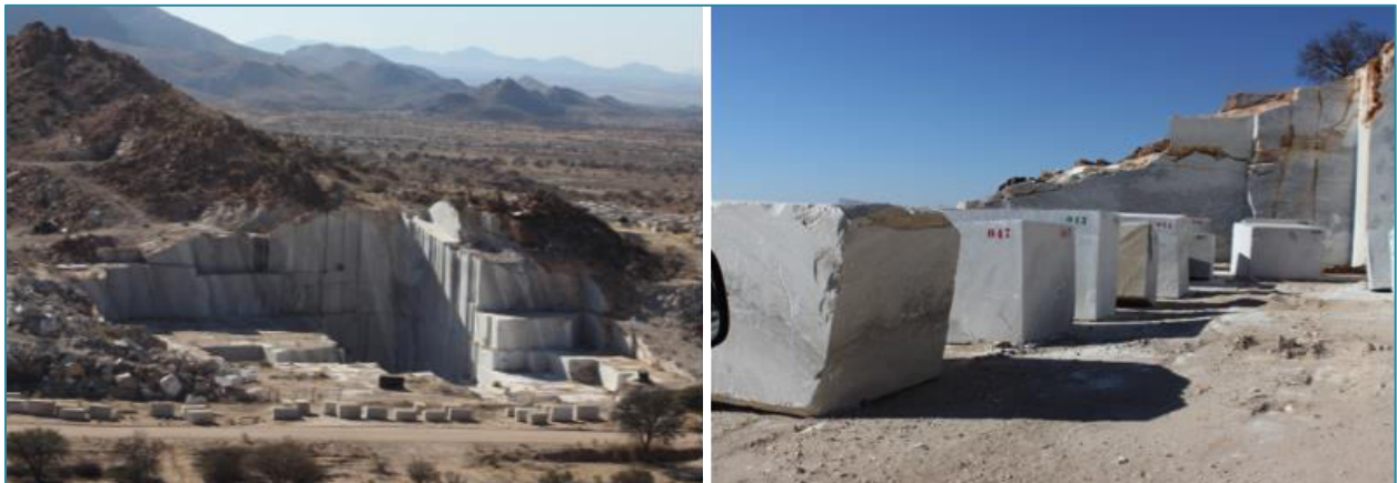
Fig 1: Shows general setup of a marble quarry where block are extracted and stored before being hauled to the harbour town for shipping (this is the least radioactive quarry activity).

The core activities of Mr. Inyenga's operation, apart from minimum value addition by way of cutting the marble into block and processing into household products such wash basins and table-tops, also includes: - Exploration of Semi-precious Stones - Quarrying of Marble (Dimension Stone).