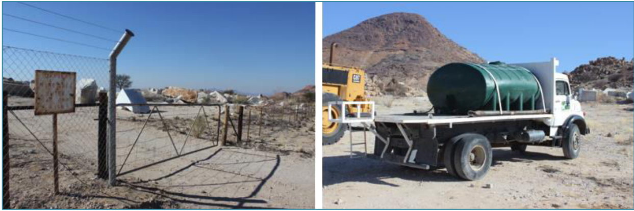
Fig 5: Mine site with the key infrastructure depicted in the background i.e. site fence and entry gate, water supply truck

Water for both domestic and operational use is sourced from the main farm boreholes and supplied by truck on a weekly basis (1000 litres) and currently stored in an equivalent sized tank, however plans are to expand storage capacity to 5000 litres month supply. Energy is supplied by 5 Watt diesel powered generator, used mainly for food preservation and lighting at the lodging facility, while for cooking the energy needs are met use of gas. The diesel supply for the earthmoving equipment is stored in raised 4500 litres capacity tanks (Fig 10) and is also brought in by truck to the project site on pre-existing farm tracks.