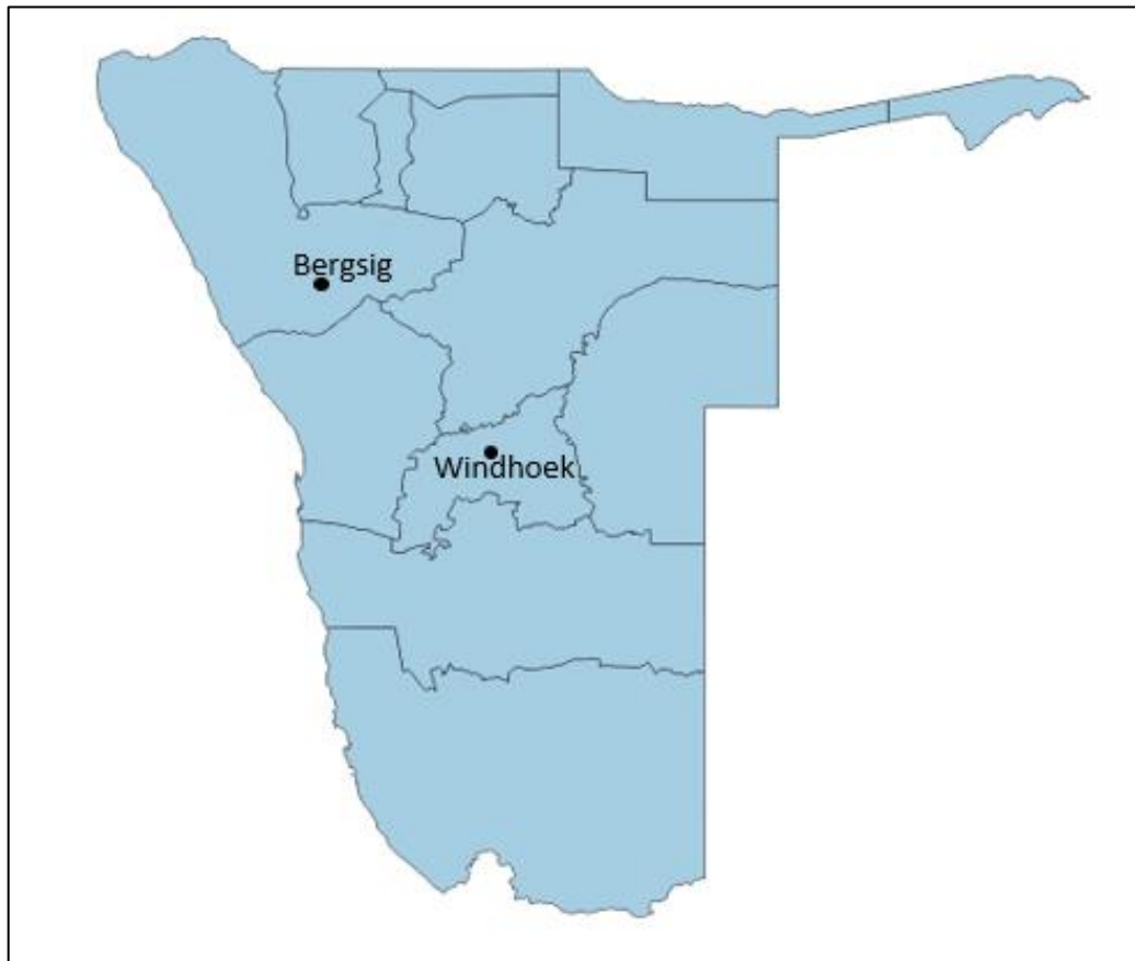
Figure 1: Bergsig Location Map

The EMP is for an existing scheme and it is therefore only for the operation and maintenance of the scheme.