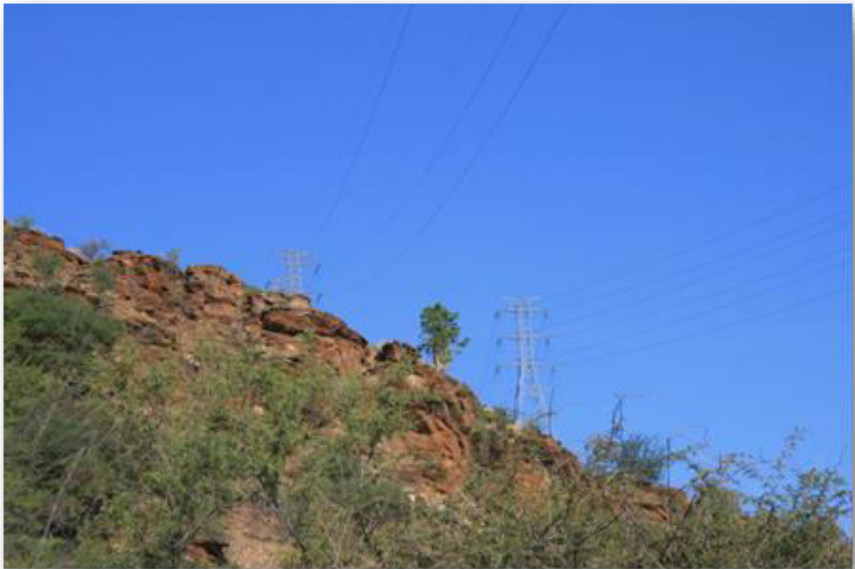
Figure 2: The 220kV Van Eck– Auas transmission line traversing through the mountainous areas

The 220kV Van Eck – Auas transmission line (Van Eck-Auas 2/3) falls within the vegetation type known as the Highland Savannah or the Highland Shrubland. Some sections of the line route passes through mountainous and rocky terrain with the dominant tree/shrubs being Vachellia (previously known as Acacia species) ( V. erubescens and V. mellifera ), Dichrostachys cinerea and Tarchonanthus camphoratus . Other section, passes through flat/undulating terrain with the dominant tree/shrubs being Vachellia species ( V. hereoensis and V. mellifera ) and Tarchonanthus camphoratus