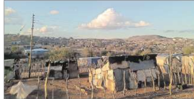
About 5 000 people live at Donkerhoek.

"I have been living here my whole life and I would like them to build toilets for us. Councilors have come and gone with their empty promises. It is evident that they only wanted votes. It is a safety risk for us especially women and girls to walk distances just to relieve ourselves especially at night," she said.