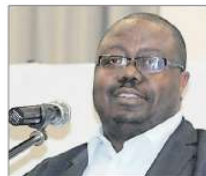
Statistician-General of the Namibia Statistics Agency (NSA) Alex Shimuafeni.

The agriculture and forestry sector surged to 47.2 percent in real