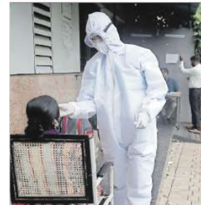
Acceleration in the health sector is owed to the easing of the fiscal consolidation policy in the sector, coupled with the emergence of the pandemic.