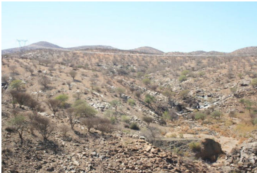
Figure 2. Typical Khomas Hochland rocky areas with various drainage lines are viewed as sensitive habitat (“high” and/or “medium”).

This transmission line passes through urban area (Windhoek) and thereafter through typical Khomas Hochland rocky terrain until the pro-Namib and Namib Desert area with the dominant tree/shrubs being Vachellia species ( V. hereroensis , V. mellifera , A. reficiens ) and Catophractes alexandri . The route passes through 7 “hotspot” areas with 5 and 2 areas classified as “high” and “medium” sensitivity, respectively. The areas of “high” sensitivity are viewed as the Goreangab Dam and water treatment works in the Windhoek urban area; all the various larger river/ephemeral drainage lines (e.g. Kuiseb River); mountains; rocky outcrops/areas (i.e. areas with high biodiversity) while “medium” sensitivity were some rocky areas and smaller drainage lines not well vegetated.