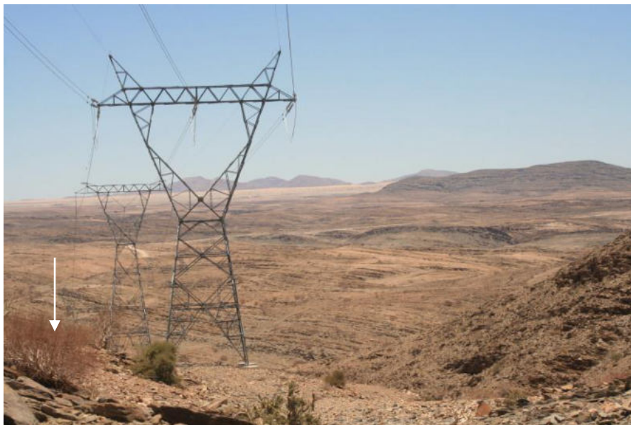
Figure 4. The rocky areas with numerous Commiphora spp. (e.g. C. virgata – See arrow) descending to the pro-Namib and Namib Desert (Pylon #511 area) are viewed as sensitive (“high”) habitats.