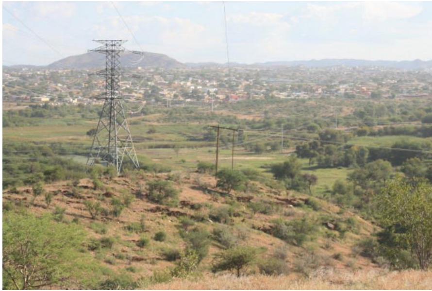
Figure 5. Goreangab Dam and the water treatment works area is viewed as sensitive (“high”) habitat, albeit in the Windhoek urban area.