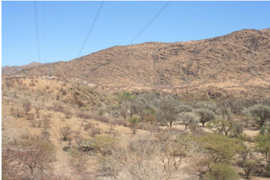
Figure 3. Larger well vegetated drainage lines such as the upper reaches of the Kuiseb River are viewed as sensitive habitats (“high”).