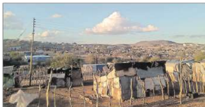
About 5 000 people live at Donkerhoek.

"I have been living here my whole life and I would like them to build toilets for us. Councillors have come and gone with their empty promises. It is evident that they only wanted votes. It is a safety risk for us especially women and girls to walk distances just to relieve ourselves especially at night," she said.