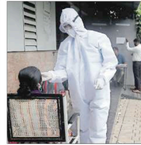
Acceleration in the health sector is owed to the easing of the fiscal consolidation policy in the sector, coupled with the emergence of the pandemic.