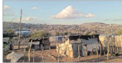
About 5 000 people live at Donkerhoek.

"I have been living here my whole life and I would like them to build toilets for us. Councilors have come and gone with their empty promises. It is evident that they only wanted votes. It is a safety risk for us especially women and girls to walk distances just to relieve ourselves especially at night," she said.