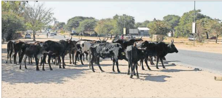
The agriculture and forestry sector surged to 47.2 percent in real value added during the second quarter of 2020.