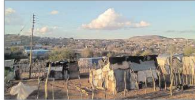
About 5 000 people live at Donkerhoek.

"I have been living here my whole life and I would like them to build toilets for us. Councilors have come and gone with their empty promises. It is evident that they only wanted votes. It is a safety risk for us especially women and girls to walk distances just to relieve ourselves especially at night," she said.