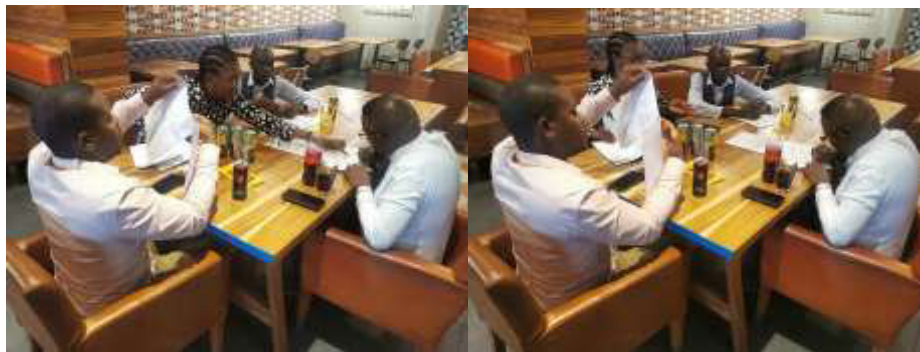
Figure 1: Briefing Consultation meeting with the Conservancy Chairperson on the 10 th of October 2023 in Windhoek

The attendance comprised of one Environmental consultant from Serja Hydrogeo-Environmental Consultants CC (Serja HGE Consultants), two Proponent representatives for EPL-8904, and the Chairperson of the Omatendeka Conservancy- as shown in Figure 1 and the signed attendance register attached hereto.