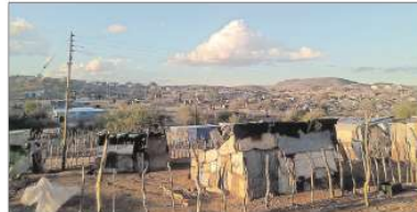
About 5 000 people live at Donkerhoek.

"I have been living here my whole life and I would like them to build toilets for us. Councilors have come and gone with their empty promises. It is evident that they only wanted votes. It is a safety risk for us especially women and girls to walk distances just to relieve ourselves especially at night," she said.