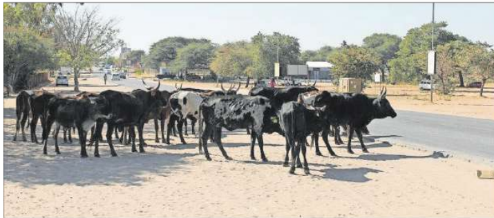
The agriculture and forestry sector surged to 47.2 percent in real value added during the second quarter of 2020.