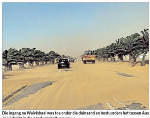
Die ingang na Walvisbaai was toe onder die duinsand en bestuurders het tussen Sand en Lüderitz in die sand vasgesit.