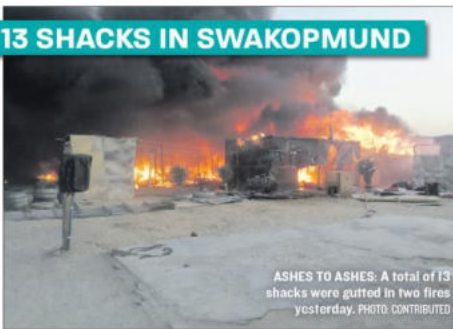
ASHES TO ASHES: A total of 13 shacks were gutted in two fires yesterday.

A total of 13 shacks were gutted in two separate fires in Swakopmund yesterday. No fatalities or injuries were reported, but about 16 victims - including four children - were affected by the first fire. According to Inspector Ileni Shapumba, police commander for community affairs in the Erongo Region, the first incident happened around 07:55 in Mondesa's Tulinawa near the intersection of Monica Geingos and Stefanus