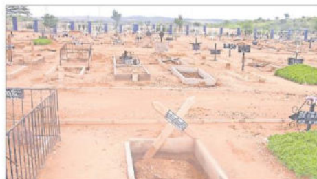
Voormalige werknemers van die arbeidsministerie - wat intussen dood is - ontvang steeds salarisse.

“Die rekeningbeampte het aangedui alhoewel die begunstigdes op die ministerie betaalstaat is, het die ministerie nie toegang tot inligting