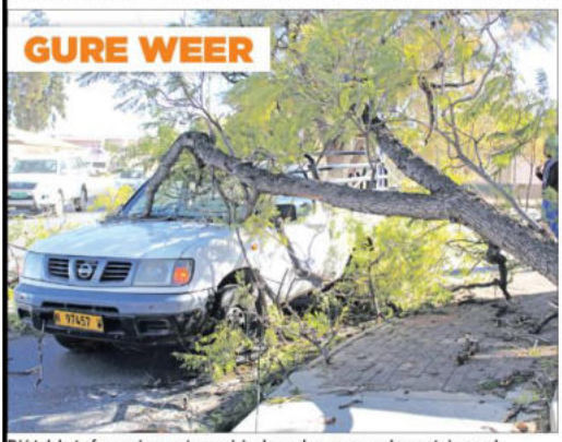
GURE WEER Dié tak het afgewaaï en op 'n munisipale werker en sy werksvoertuig geval.