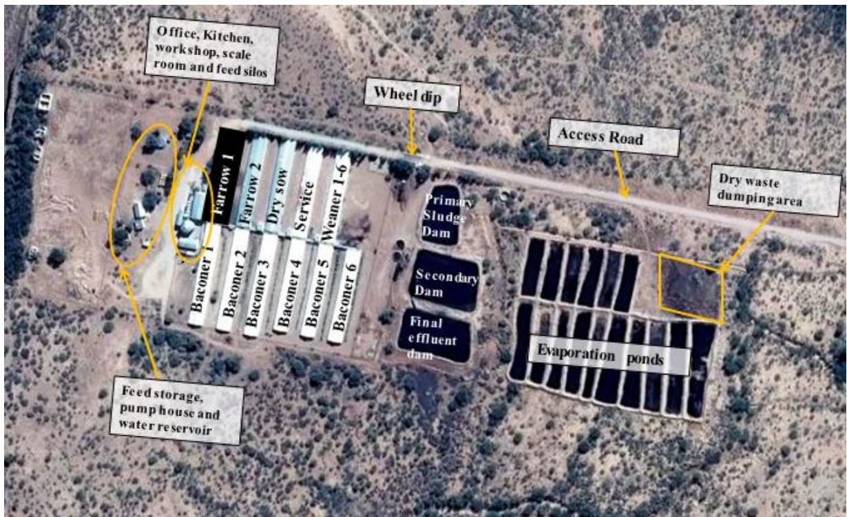
Figure 2: General overview of facilities at Mariental Piggery.