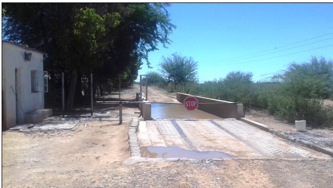
Picture 1: Securing gate and wheel dip at the entrance to the piggery

As part of the farm's biosecurity measures, there is a security gate at the entrance to the facility to control movements to the facility. There is also a wheel dip at the entrance gate to ensure that all vehicles and passengers entering the facility are disinfected to prevent the spread of diseases.