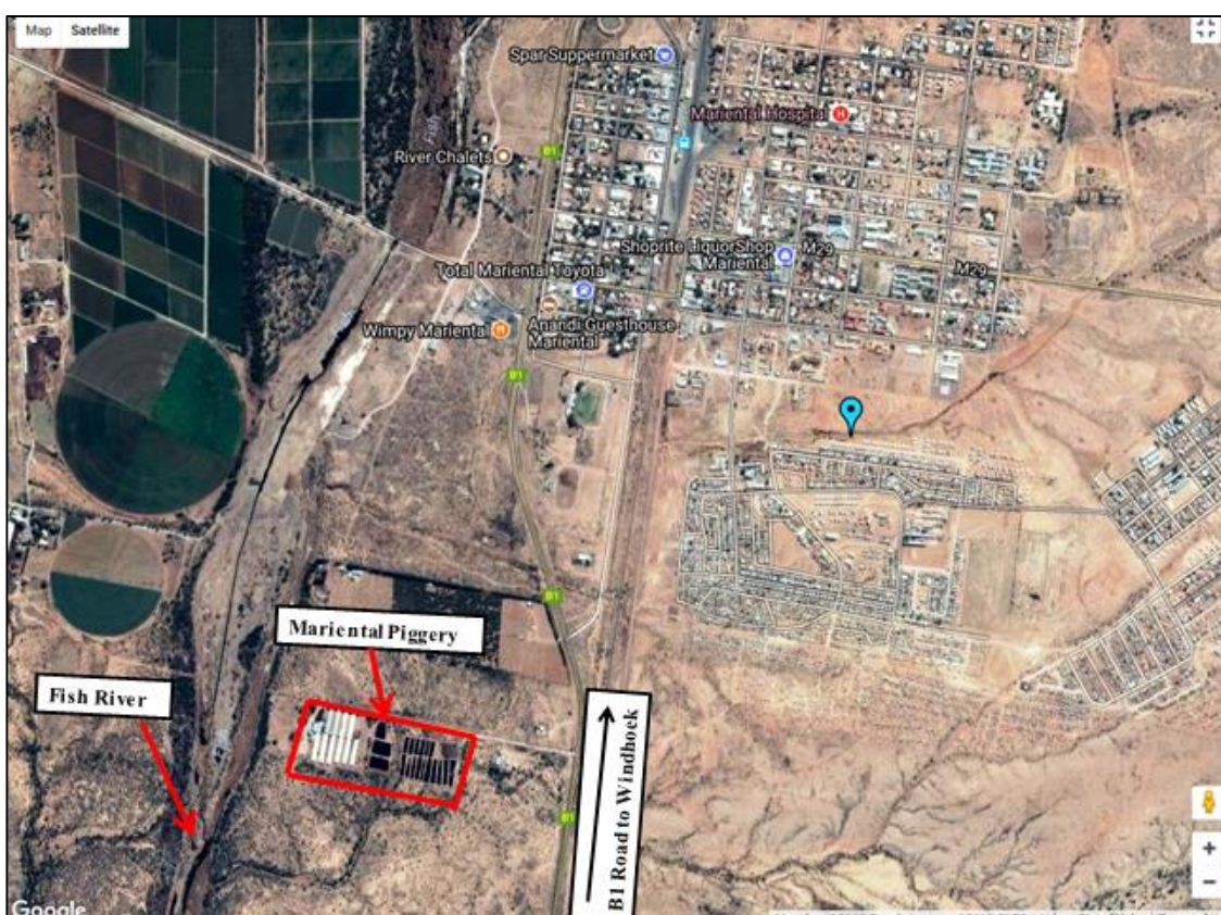
Figure 1: Location of Mariental Piggery.

Mariental Piggery Pty Ltd. Is located on a site of 23 hectares, approximately 1.5 kilometres south of Mariental just off the national road (B1) between Mariental and Keetmanshoop. The farm is bordered by the Fish River to the west, brick factory to the south and a small holding (date farm) to the north. Figure 1 below indicates the location of Mariental Piggery in relation to the Mariental Town.