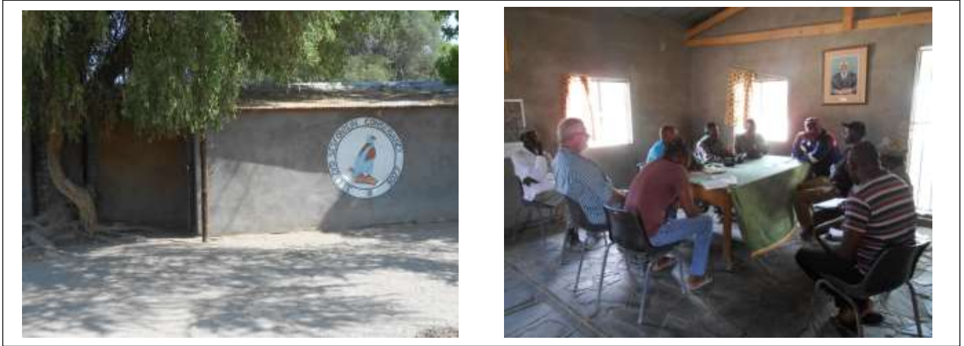
Image 4: Stakeholder meeting at Sesfontein Conservancy