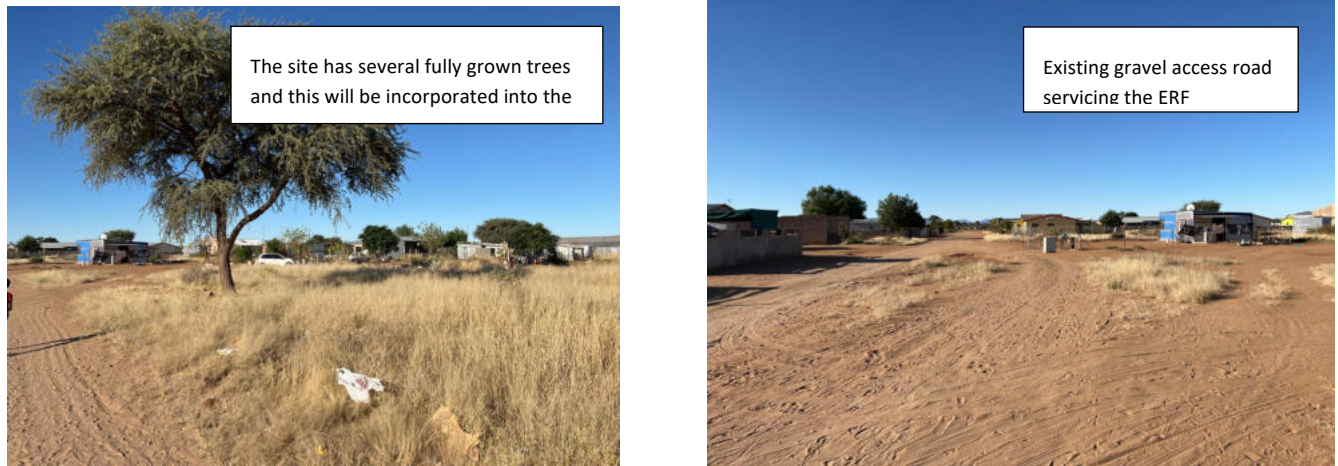
Figure 3: Environmental and social setting of project locality.

As illustrated on the top images, Erf 810, Rehoboth Extension 3 is a brownfield, i.e., it is already developed (not pristine), hence disturbed to some extent that only few trees could be seen standing. Erf 810 Ext. 3, Rehoboth is currently accessed by a gravel road and several informal roads cutting through the erven. The tree count on site returned less than 20 trees which will all be preserved during development.