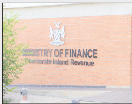
PAY THE DUTIES: The finance ministry is cracking down on fraudulent imports.

Between 2010 and 2016, Namibia allegedly lost N$3.5 billion in unpaid customs duties, resulting in the 2017 arrest of Walvis Bay businessman Julius Lauren-