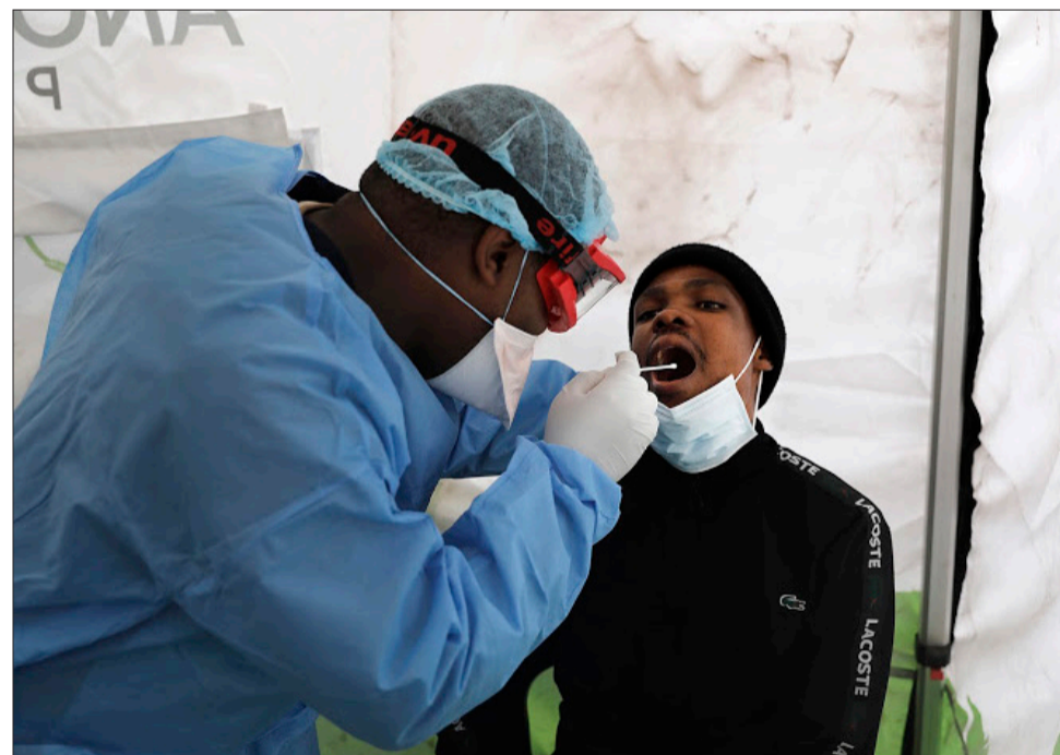
Ovasouth Africa ina va hala meenhele dokulikalela depangelo

mahapu ovanhu ovo veli kalekelwa momaumbo mu na ovakulupe, ile moubashu shaashi kave shi ngeenge ove napo omhito imwe vei pewa kepagelo. Ovanambeleva vohaku mwa kwatelwa eendohotola inave va pa ouyelele,” ta ti ngaho.