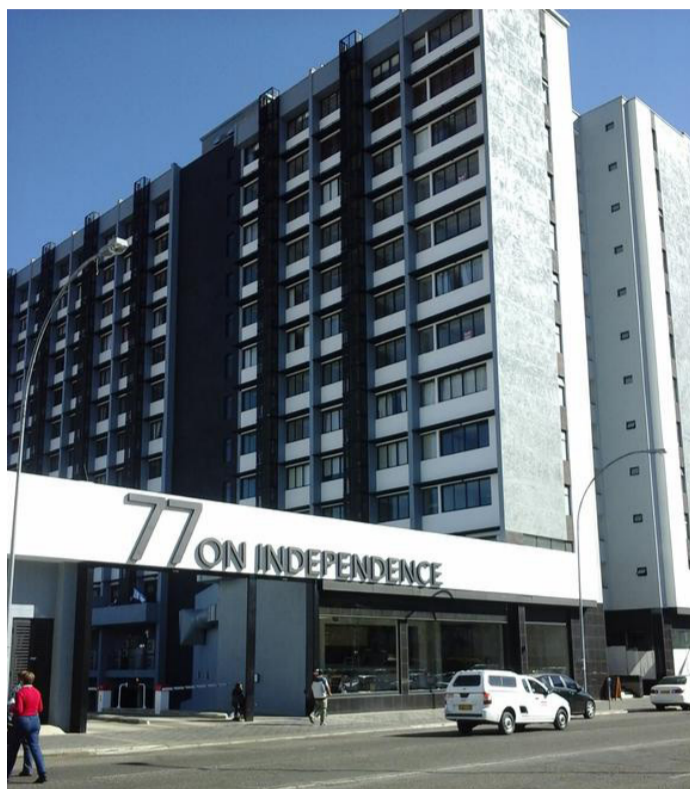
Precautionary measures... The residential and retail complex on Independence Avenue where Namibia's 33rd Covid-19 case was traced to.

"The suspected officer has been on duty since then and has been mingling with other employees for five days. On Thursday, 18 June 2020, the colleague participated in an urgent meeting that involved more than 10 managers and