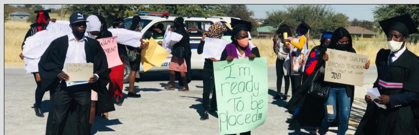
Feeling left out... A group of qualified, unemployed teachers during the demonstration at Omuthiya.

Said Uirab: "This decision comes after careful consideration of the possible risk of exposure as one of our employees that works at the head office resides at 77 on Independence Avenue that was reported as one of the places Covid-19 case 33 visited. We urge all stakeholders to interact with us via email, cell phones and other available means of communications as we continue to render service."