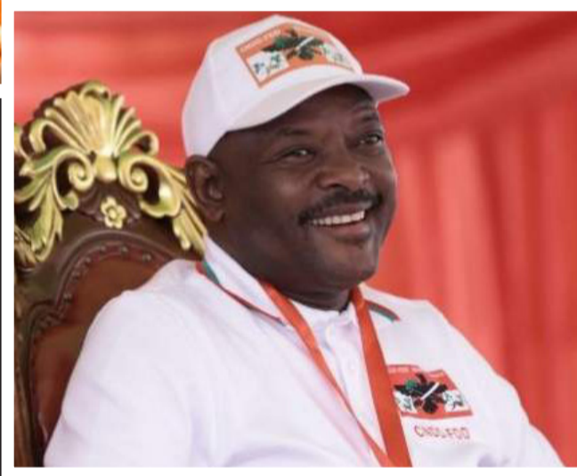
Nakufya Pierre Nkurunziza oo a li omupresidente waBurundi okwa pakwa mEtitano.