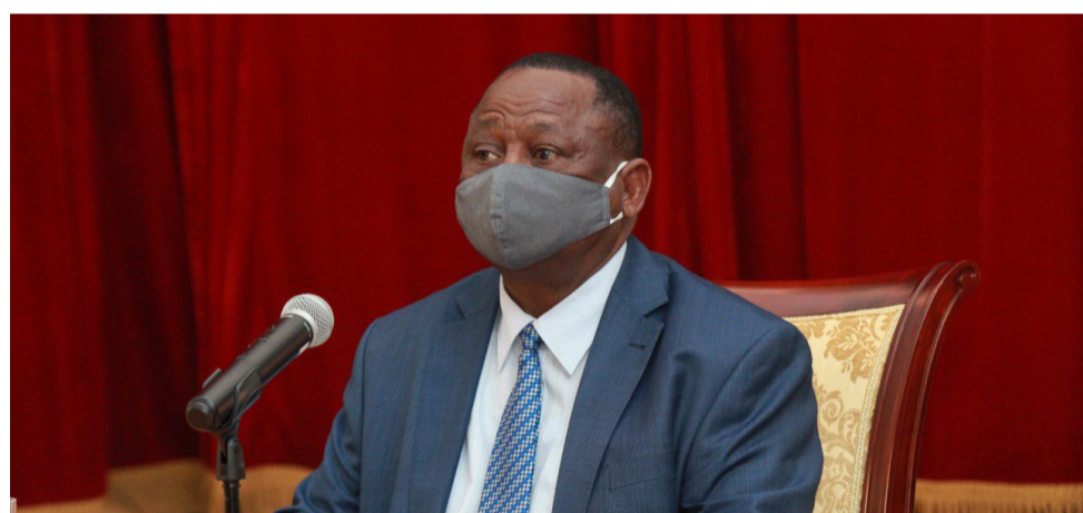
Long overdue... Health minister Dr Kalumbi Shangula.

"It is envisaged that the African Medicine Agency will provide a better environment for legitimate manufacturers to flourish and improve local manufacturing of quality products," he added. He said the financial and technical sustainability of regional initiatives remains uncertain.