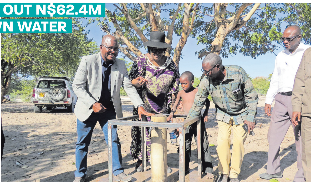
CONSUMPTION: A total of N$62.4 million worth of water was used by vulnerable and reconnected households between 19 March and 31 May.

"Costs incurred in reconnecting suspended water supply to defaulting ratepayers or customers as well