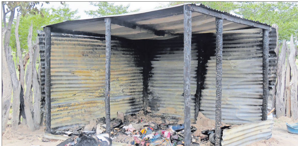
UP IN FLAMES: Two families at Ebandulo and Oniihandi lost everything after mysterious fires engulfed their homesteads.