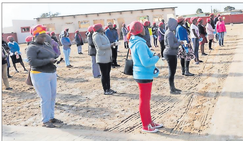
HIGH-RISK: Kuisebmond in Walvis Bay has become a hotbed of Covid-19 cases.