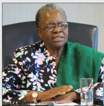
'Incorruptible'... Deputy Prime Minister Netumbo Nandi-Ndaitwah.

However, on Tuesday, while addressing the National Assembly, Nandi-Ndaitwah broke her silence, postulating that all Namibians have benefited from