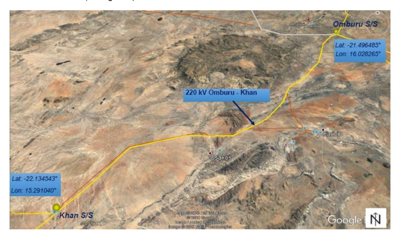
Figure 1: Map showing the 220 kV Omburu - Khan 1 & 2 transmission line

The 220kV Omburu - Khan 1 & 2 powerlines were commissioned in 2010 and 2011 respectively. The powerlines are 221.4 km in length and falls within the vegetation type known as the Semi-desert, Savannah Transition Zone. This powerlines runs from Omburu Substation to Khan Substation (see figure 1).