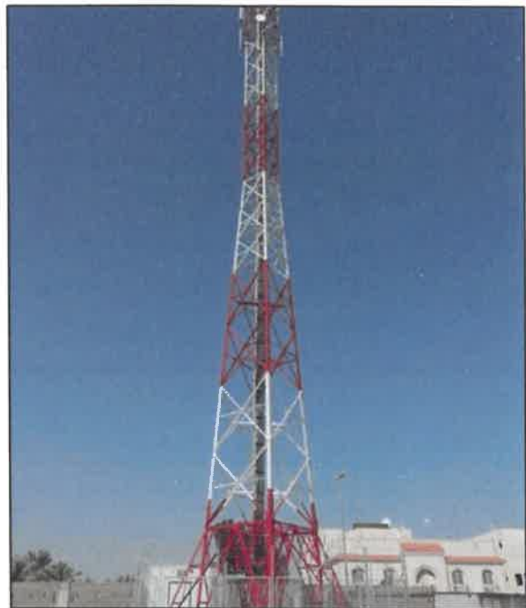
Figure 2: Typical Telecommunication tower (Left) Proposed tower structure (right).