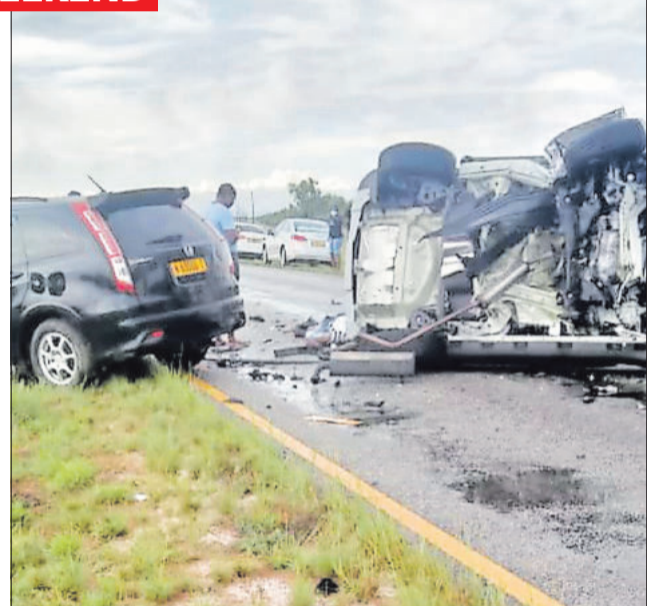
FATALITIES: A Tsumeb-Oshivelo road crash killed three people and a kudu last Friday.

vehicles are a white station wagon bought from Pupke-witz Toyota in Tsumeb to be delivered to the owner and a privately-owned black seven-seater sedan.