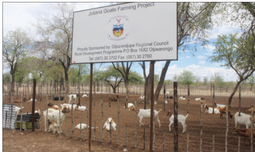
Hard at work... The land reform ministry overachieved its target by purchasing twice as much resettlement farming land as in the last financial year.