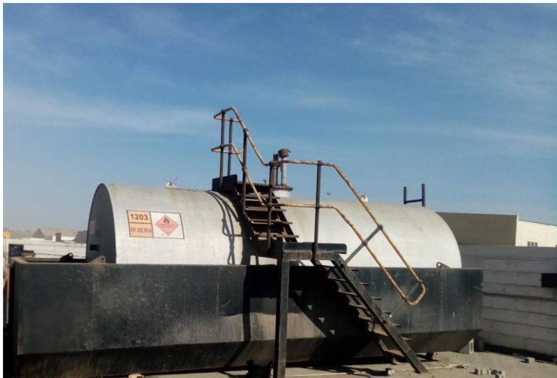
Figure 1: Above Ground Engen 23 000 L tank

The existing Engen installations have a valid Petroleum Consumer License approved by the Ministry of Mines and Energy. The site operations and installation are in accordance with Engen Namibia (Pty) Ltd policies and regulations. Diesel is stored in a 23 000L capacity above ground tank see Figure 1 below.