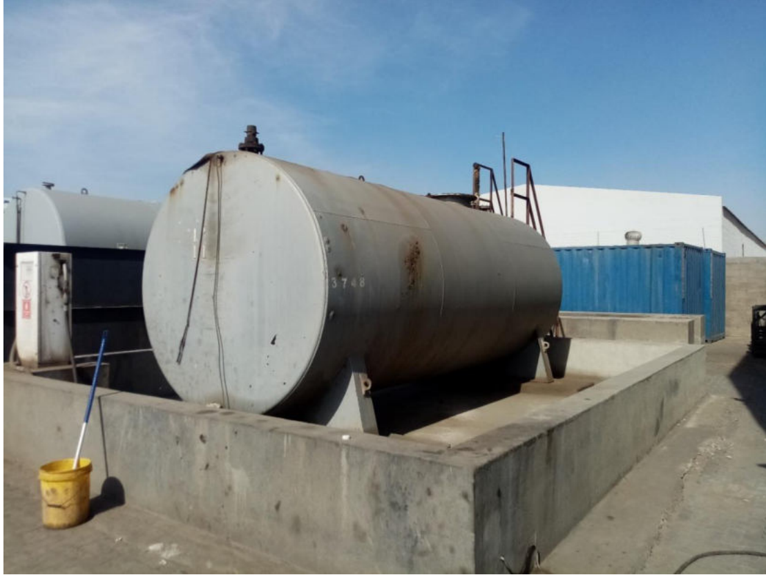
Figure 1: Above Ground Engen 80 000 L tank