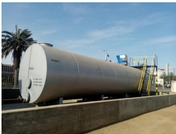
Figure 1: Above Ground Engen Diesel 83 000L capacity tank

The site operations and installations are in accordance with Engen Namibia (Pty) Ltd policies and regulations. The diesel is stored in two tanks on site consisting of one 63 000L capacity self-bunded tank and another 83 000L capacity above ground tank see Figures 1 and 2 below.