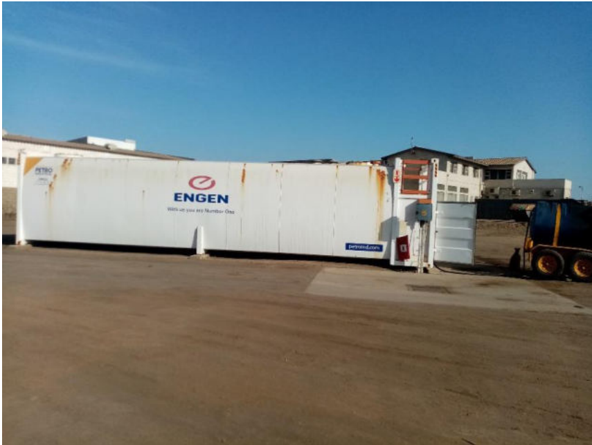
Figure 2: Self-bunded Engen 63 000L capacity tank