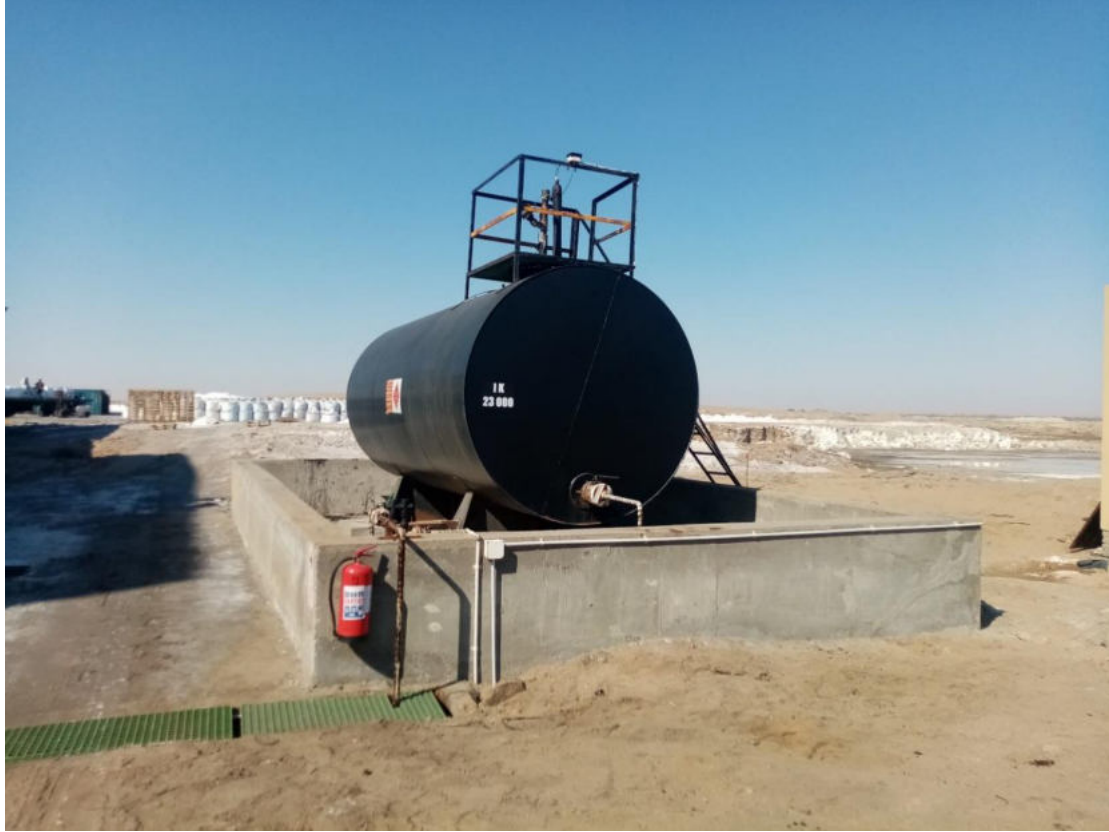
Figure 1: Above Ground Engen Illuminating Paraffin tank