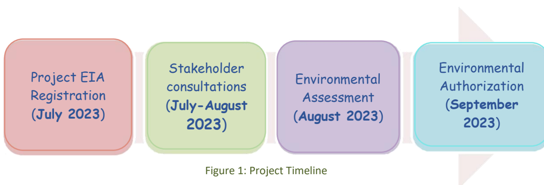
Figure 1: Project Timeline

These three phases will culminate in the approval or rejection of the project i.e. positive or negative Environmental Authorisation.