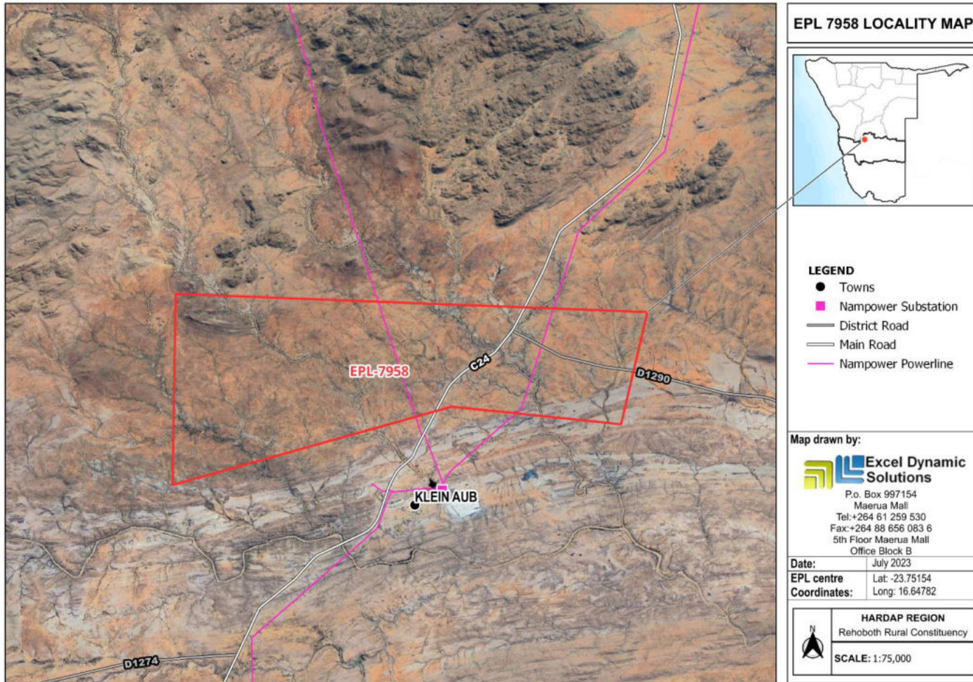
Figure 1: Location of EPL 7958