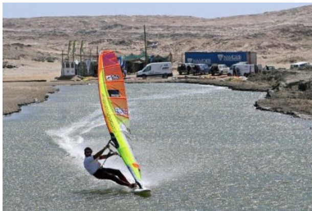
The current station during the event is very limited and insufficient

Events like these require decent facilities, as it is normal that the weather conditions are predominately cold and extremely windy. We need to uplift the comfort level of the participating athletes and also to potentially increase the media exposure and spectators. With the use of a temporary and removable container-based station with clean toilet and changing facilities will have no environmental impact on the area or the lagoon. These containers will be placed as in previous years on the western side of the lagoon next to the road. Once the events are completed the containers will be removed leaving the area in its original and natural state.