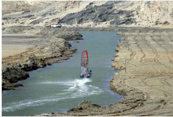
Windsurfer sailing the excavated channel