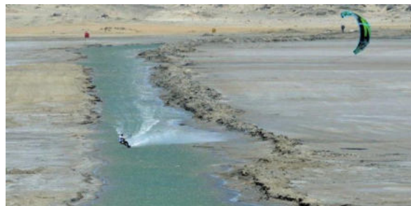
Kitesurfer sailing the excavated channel

Unfortunately for the kite surfers the existing dug-out channel turned out to be dangerous because it is too narrow and unsafe at these high speeds. With their 27m long attachment lines the kiter requires a lot more space downwind to be safe. Accidents occurred in the first year, cancelling the Kitesurfer division and participation in this event since then. This still remains a great loss of an event offering ideal conditions to the sailing fraternity. Kitesurfing is the fastest growing wind sport and is a very popular world-wide and many athletes partaking in similar events like this world-wide. There is a demand to cater for a speed challenge event for the kitesurfing division.