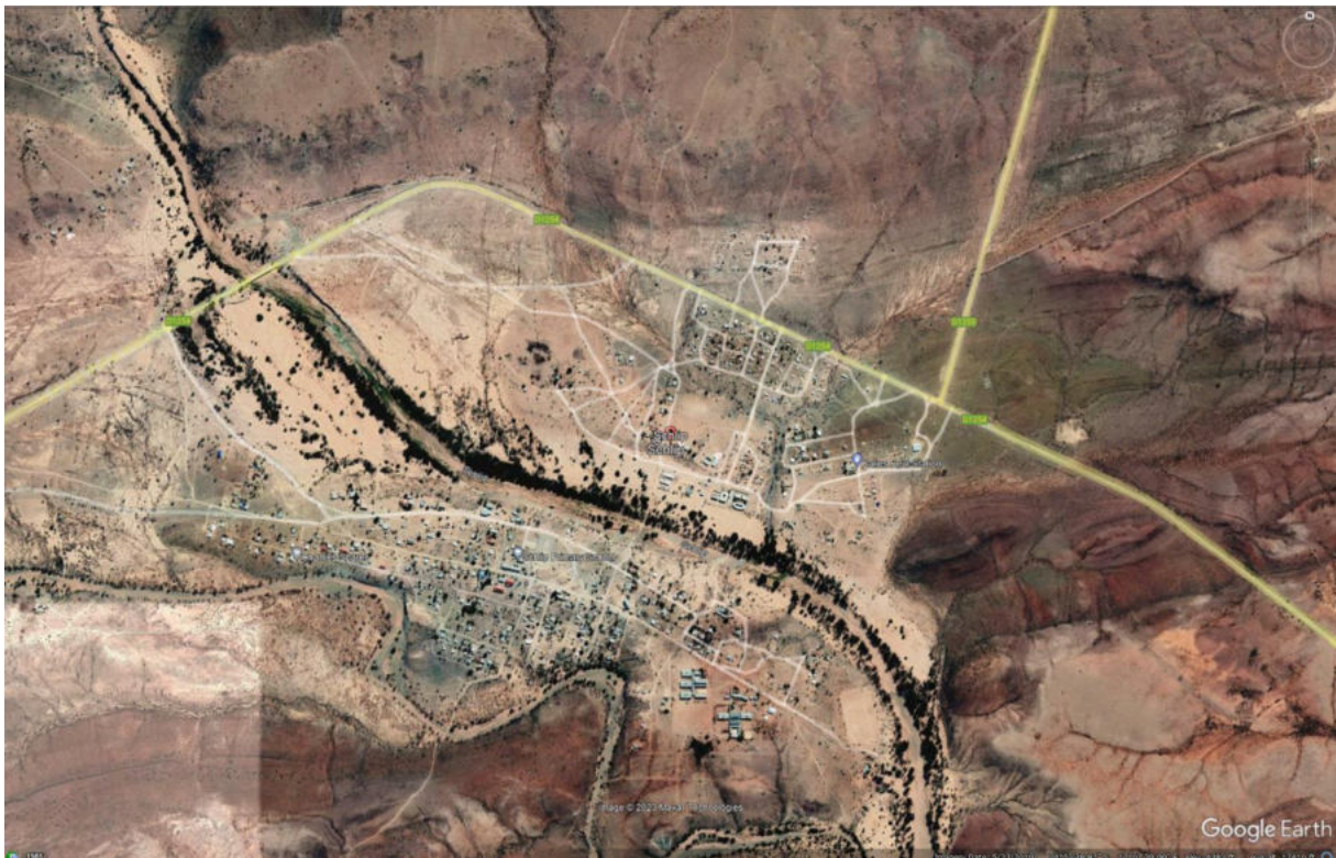
Figure 1: Schlip Location Map

The EMP is for an existing scheme, and it is therefore only for the operation and maintenance of the scheme.