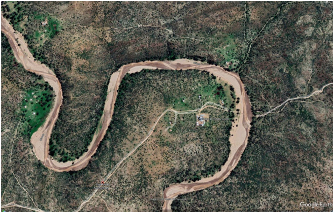
Figure 1: Kwakwas Location Map

The EMP is for an existing scheme, and it is therefore only for the operation and maintenance of the scheme.