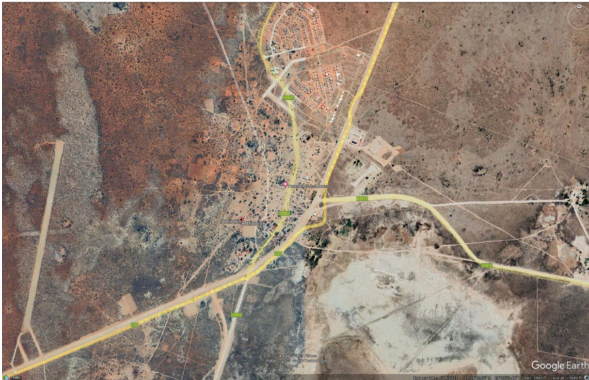
Figure 1: Aminuis Location Map

The EMP is for an existing scheme, and it is therefore only for the operation and maintenance of the scheme.