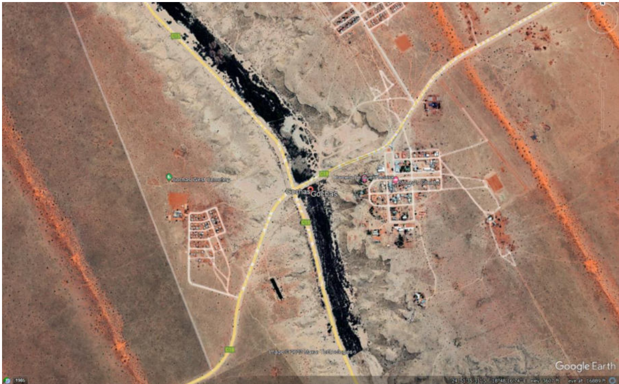
Figure 1: Gochas Location Map

The EMP is for an existing scheme, and it is therefore only for the operation and maintenance of the scheme.