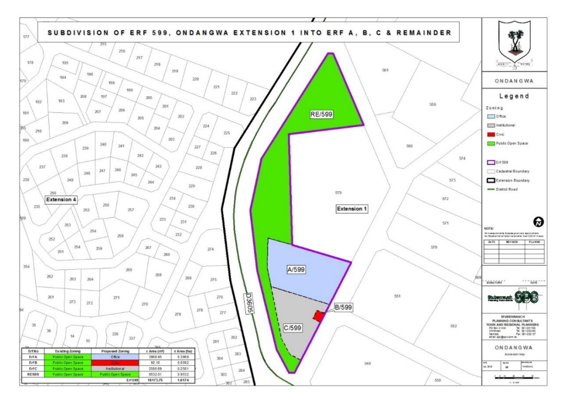
Figure 2: Subdivision of Erf 599, Ondangwa Extension 1 into Erven A, B, C and Remainder