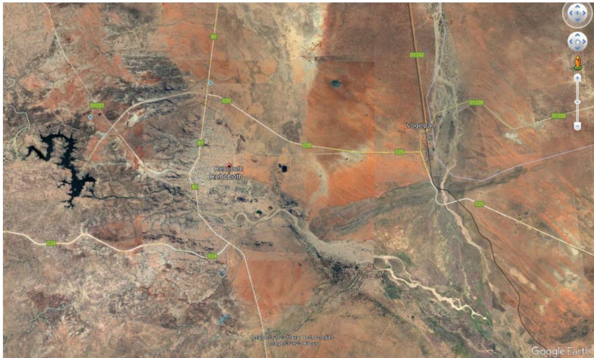
Figure 1: Rehoboth Town Location Map

The EMP is for an existing scheme, and it is therefore only for the operation and maintenance of the scheme.