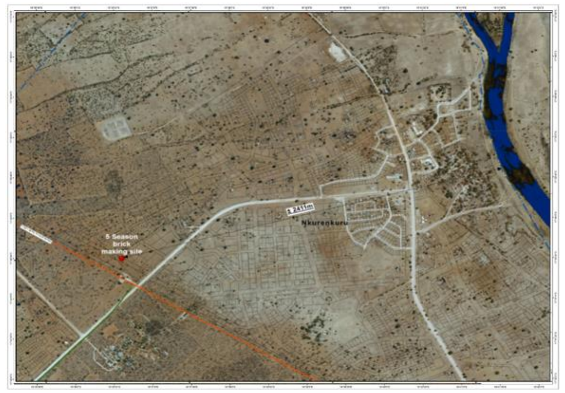
Figure 2: Locality map of the existing sand mining borrow pit site and cement brick making factory (HEEC, 2020).

The sand is harvested from a site located approximately 12 km outside of the town of Nkurenkuru in close proximity to Kahenge depicted in Figure 2 above.