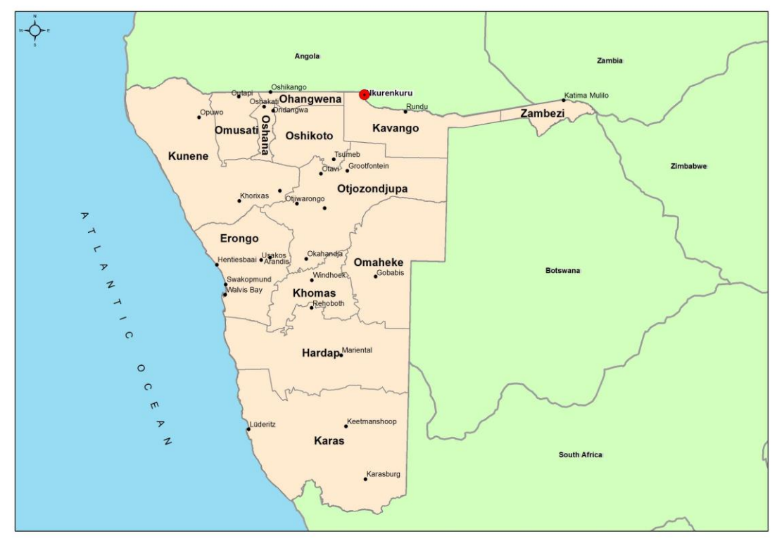
Figure 1: Locality map of Nkurenkuru

Refer to the locality map of Nkurenkuru in Figure 1 and Figure 2 for the locality of the borrow pit & cement brick making factory.