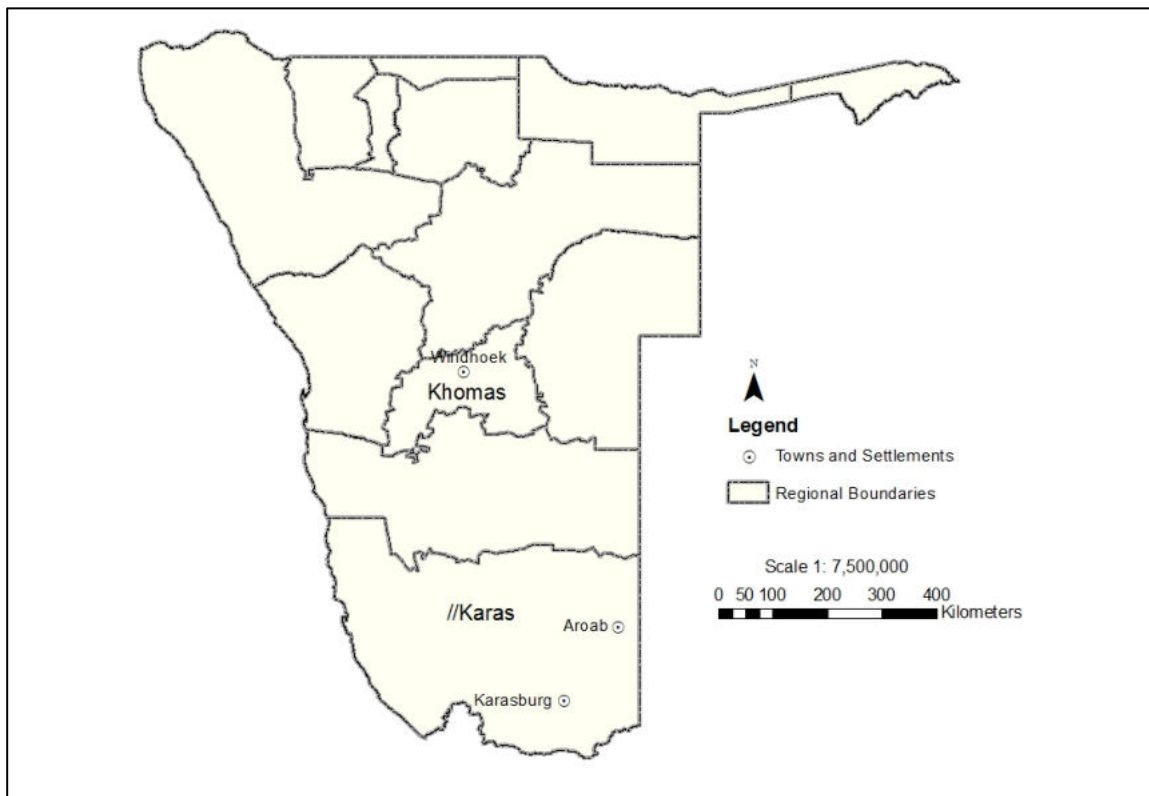
Figure 1: Aroab Location Map

The EMP is for an existing scheme, and it is therefore only for the operation and maintenance of the scheme.