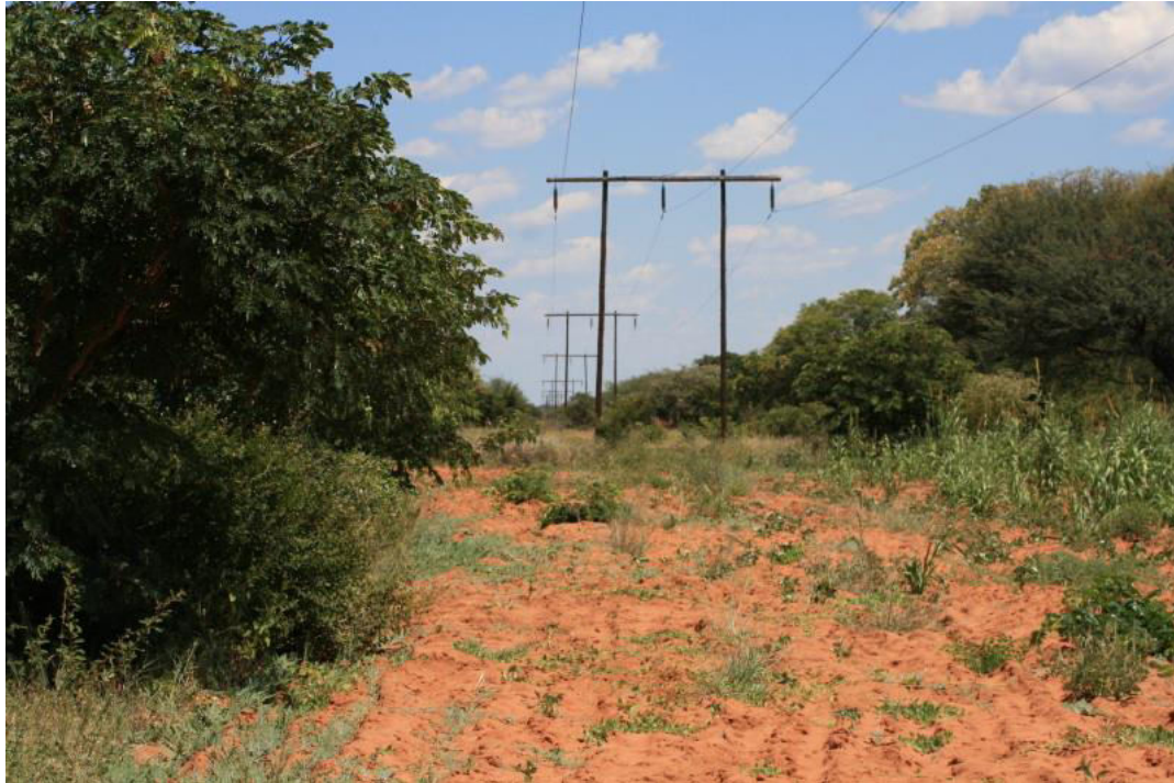
Figure 2. Typical Mopane Savannah (shrub/small trees) along the route

The 66Kv Rundu – Mpasi line passes through a vegetation type called Mopane Savannah. The main river draining the general area is the Okavango River which flows east although some ephemeral omurambas (tributaries) flow north into the Okavango River. (Cunningham, 2015).