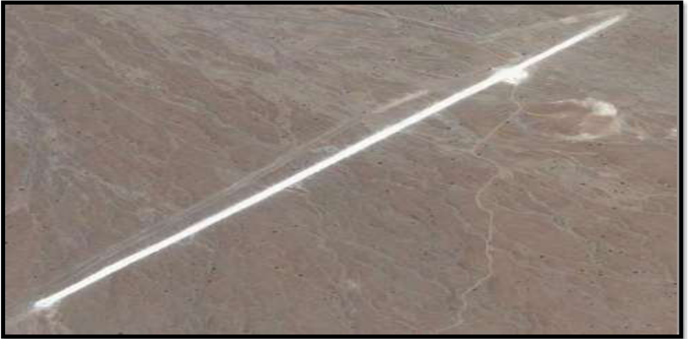
Figure 4: Damaraland Camp airstrip