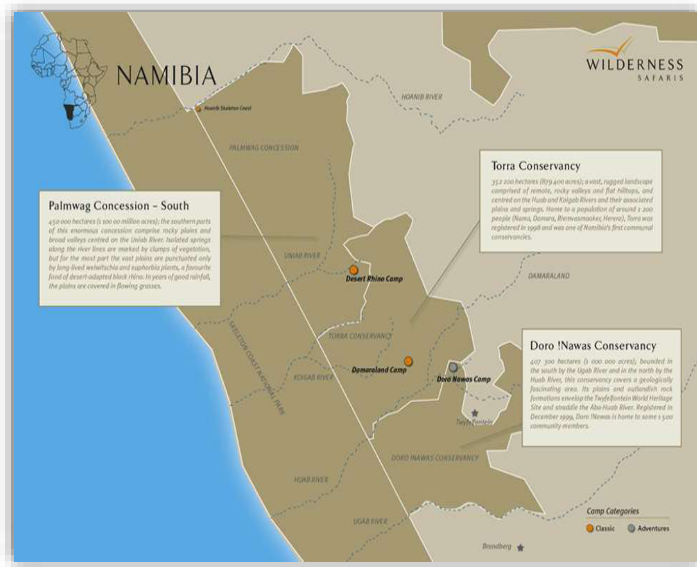
Figure 1: Torra conservancy and the location of Damaraland Camp.