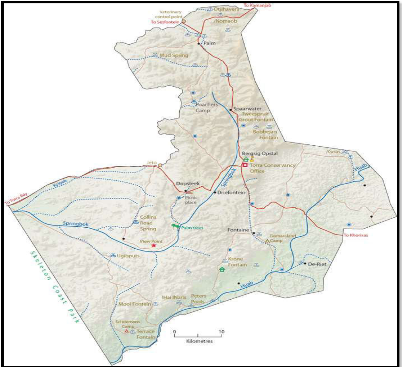
Figure 2: Torra conservancy map