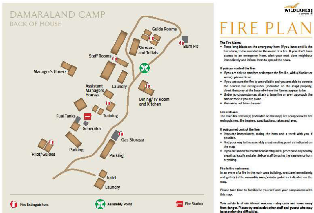
Figure 5: Fire plan and layout of the Damaraland Camp staff village