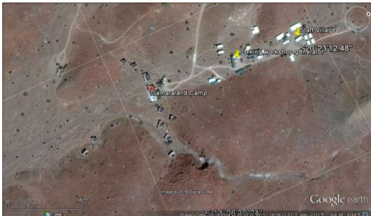
Figure 6: Google map of Damaraland camp and staff village