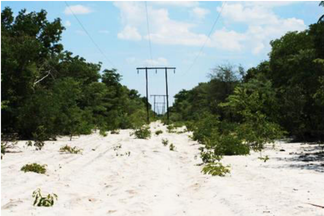
Figure 1: Bushes/trees not affecting the line left undisturbed.