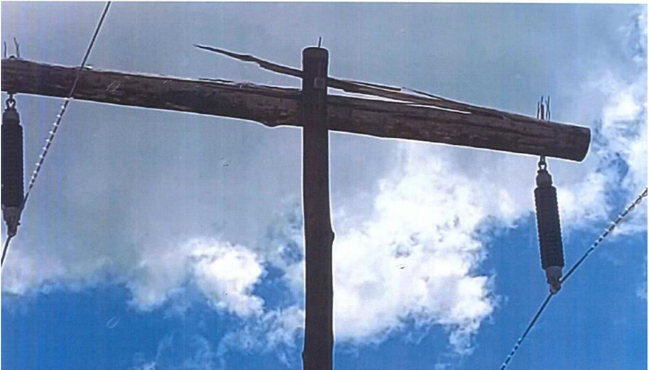
Figure 1: Example of damaged line components which were picked during inspection and were repaired.