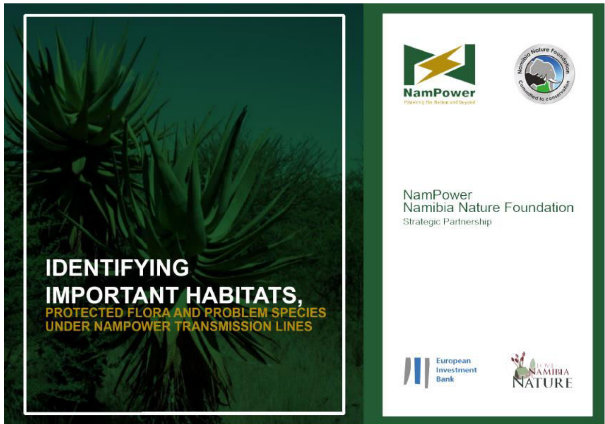
Figure 3: Cover page of the booklet that NamPower published in 2021 through its former partnership project with the Namibia Nature Foundation (NNF)