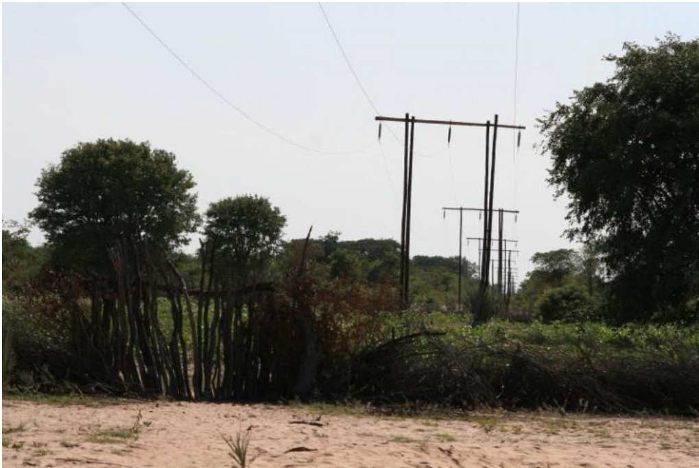
Figure 5: showing the line traversing through a mahangu field and the crops are left undisturbed.