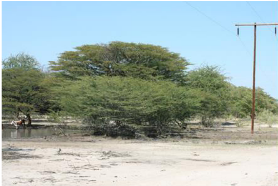
Figure 4: Showing an ephemeral pan (sensitive area) along the route with no disturbances from line activities.