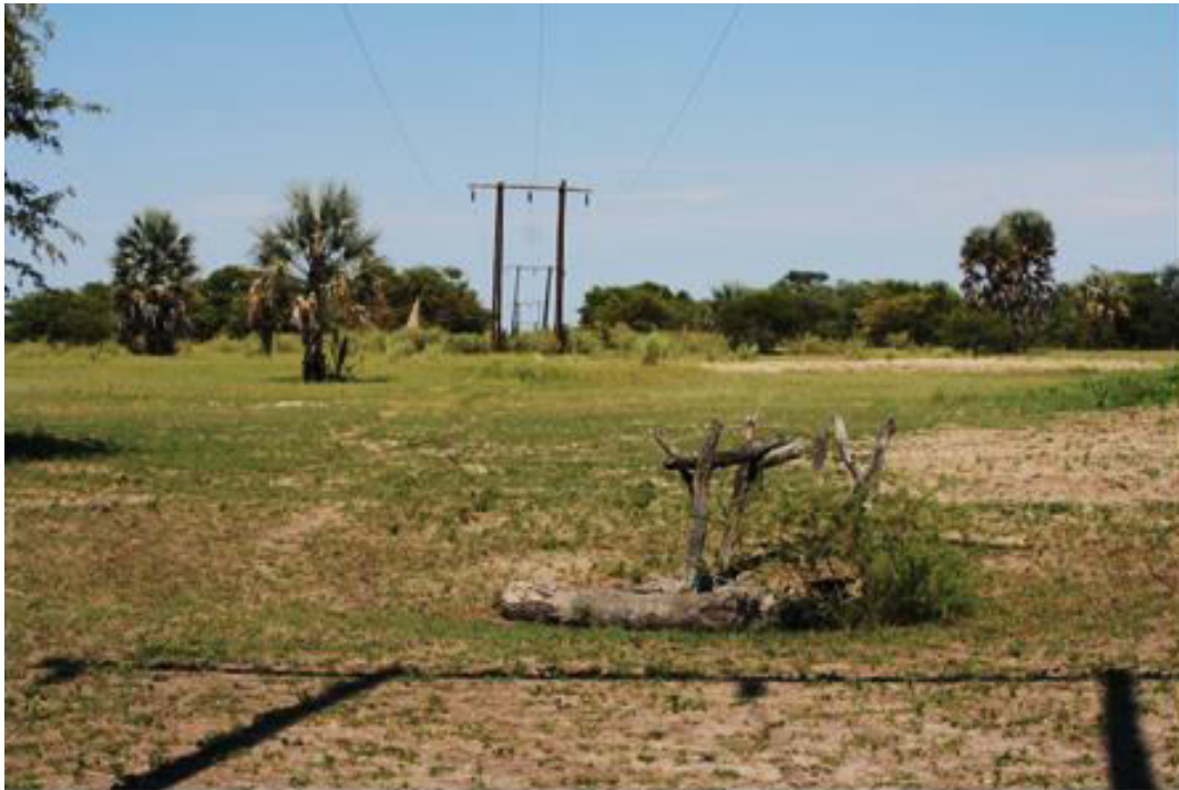
Figure 2: Shows the line servitude free of litter.