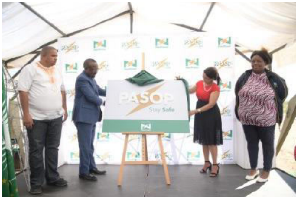
Figure 6: The launch of the NamPower Electrical Safety Campaign “Pasop, stay safe”