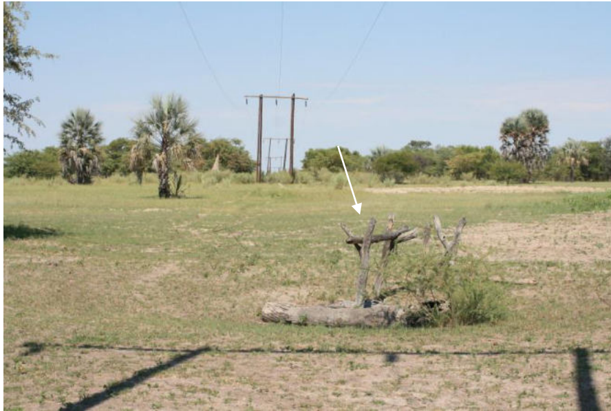
Figure 3. A well located below the line (See arrow) and viewed as an important area.