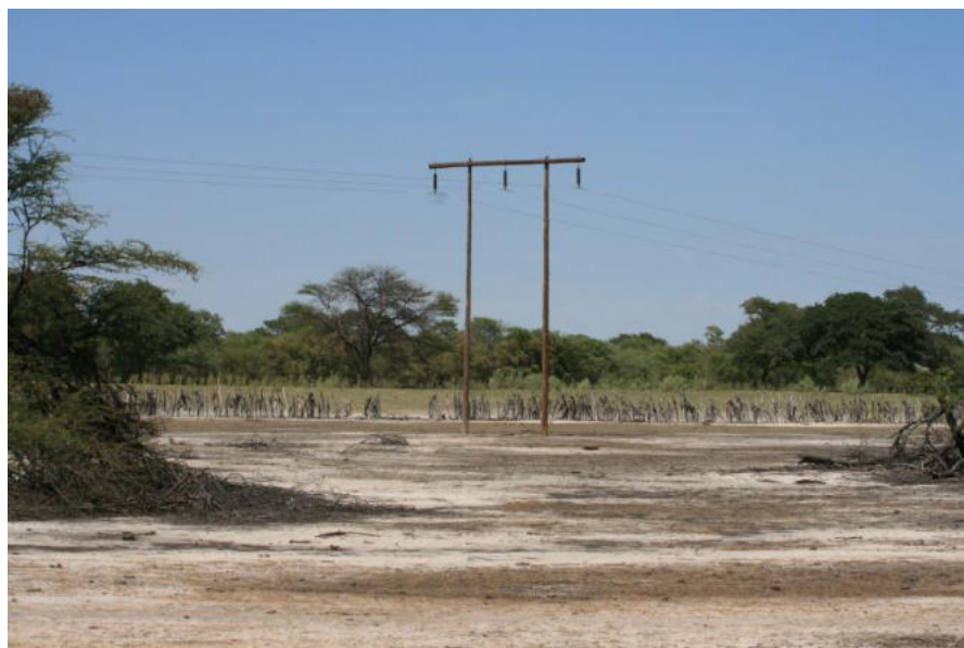
Figure 4 . Oshana – wetland area – and fenced off mahangu field – another important area where chemicals should not be applied.