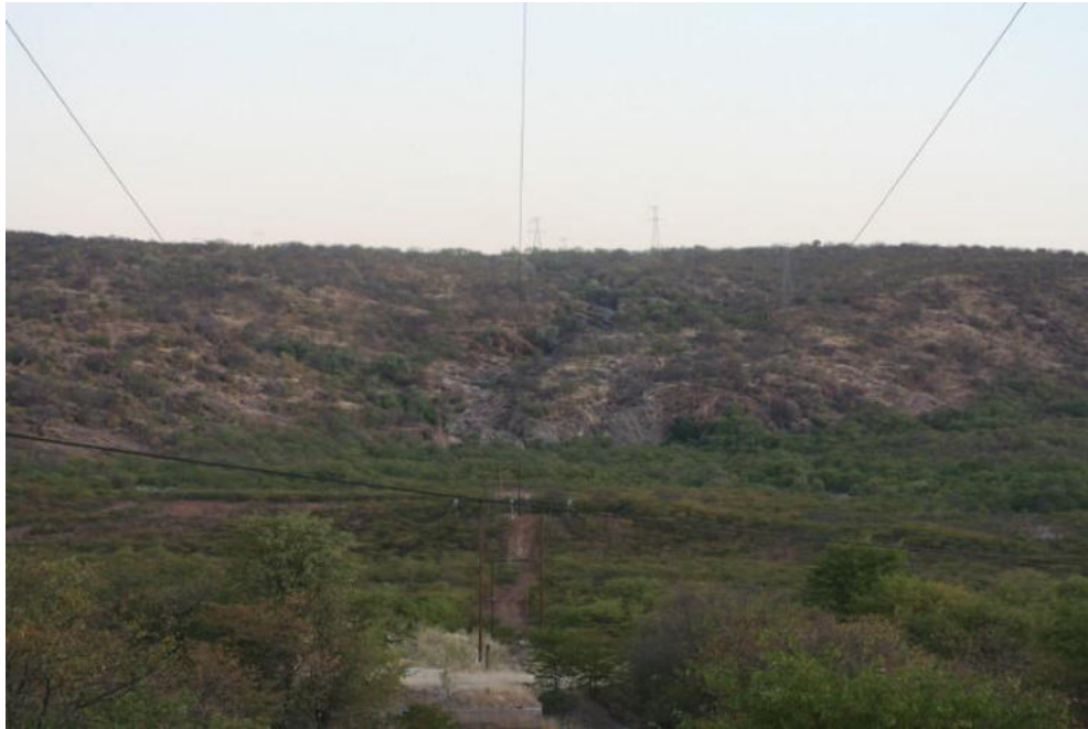
Figure 2. Rocky/mountainous area viewed as an important habitat on this line route.